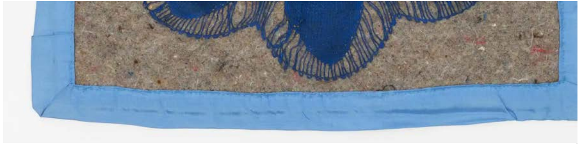
Unquiet work ... Eye with Ñandutí by Feliciano Centurión.