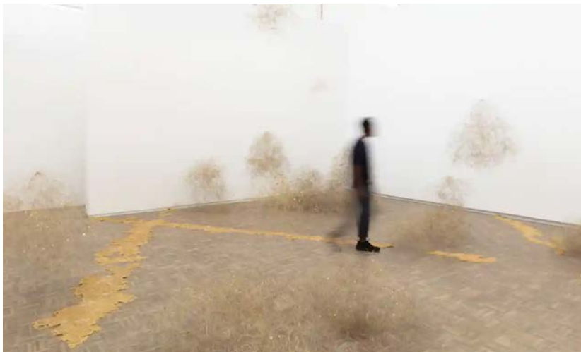
📷 Kicking up dust ... Gebedswolke (Prayer Clouds) by Igshaan Adams.

Igshaan Adams takes us on a walk through the hinterlands between two South African townships that had, historically, been deliberately segregated. Using aerial photographs to map these territories of division and exclusion, and the paths people take between them, Adams navigates physical and spiritual proximities and distances. Slender coiling and twisting wires and threads create drifting clouds and dust-devils, spangled with vortices of beads and shells, in a sort of particulate airborne soup that we walk through, as if we've kicked up dust going between places and times. Kicking up dust is what Adams does.