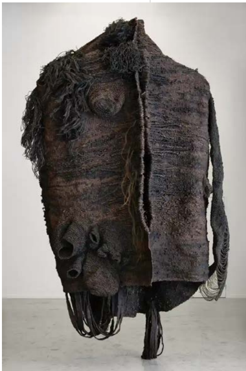
Mysterious as a bat hanging in a cave... Vêtement Noir (Black Garment), by Magdalena Abakanowicz.