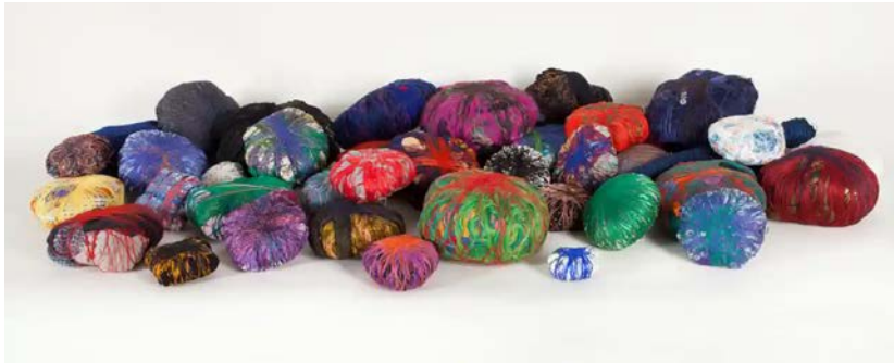
📷 Secrets and memories ... Family Treasures by Sheila Hicks.

Then life crashes in with a roar. In a tapestry by Diedrick Brackens , one black man carries another from a burning building, escaping the flames bursting around them in the gouts of flaring, latch-hooked acrylic yarn that erupt from the surface.