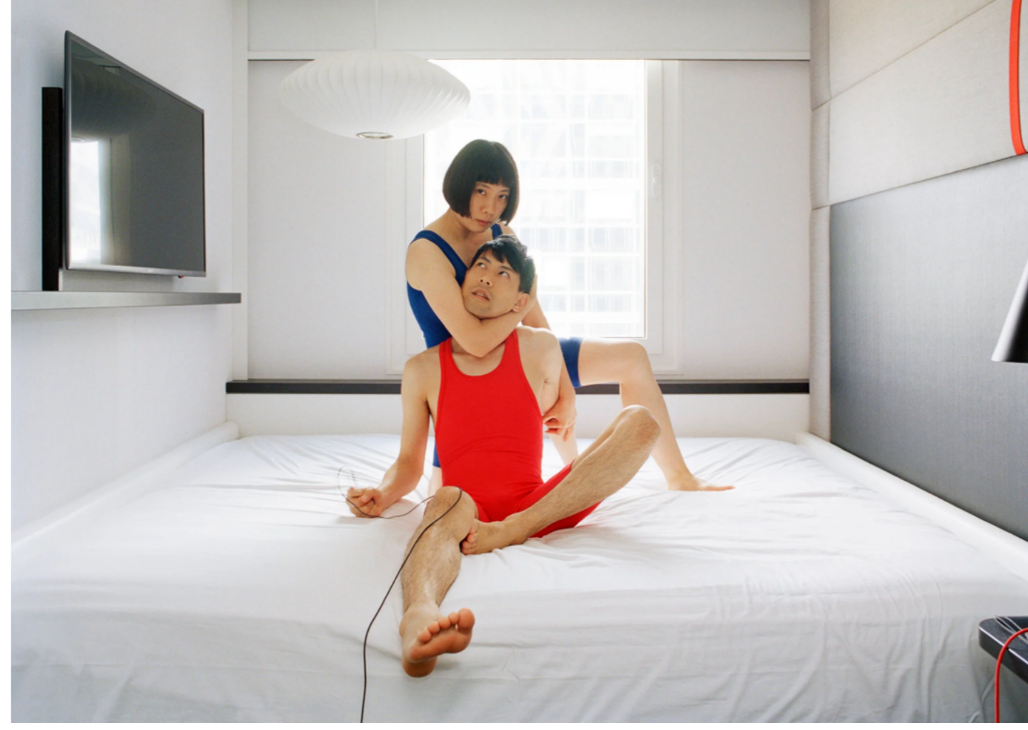
"Bed Wrestling 3014 (Rear Chin Lock)", featured in Liao's Hong Kong exhibition.

For example, in an image called After Psyche Revived by Cupid's Kiss (2019), Liao's partner, who is referred to as Moro, is seen lying prone and passive on Liao's lap wearing nothing apart from a pair of pulled-up white cotton socks and what looks like an apron tied around his waist.