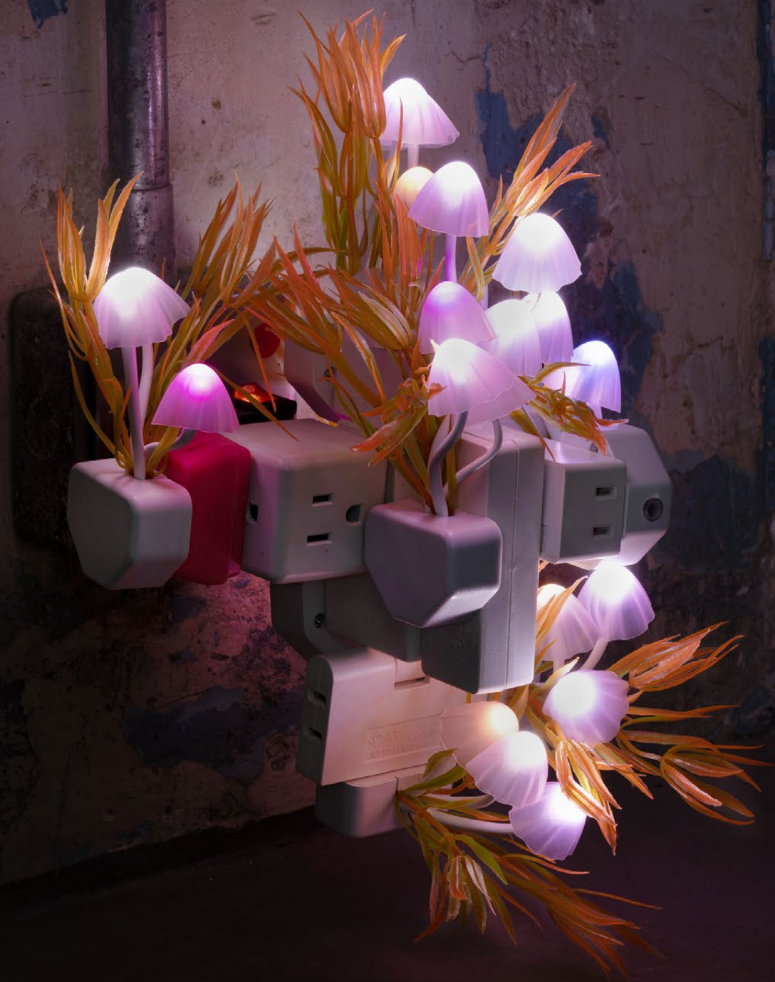
Night Mushroom Colon (Eight)