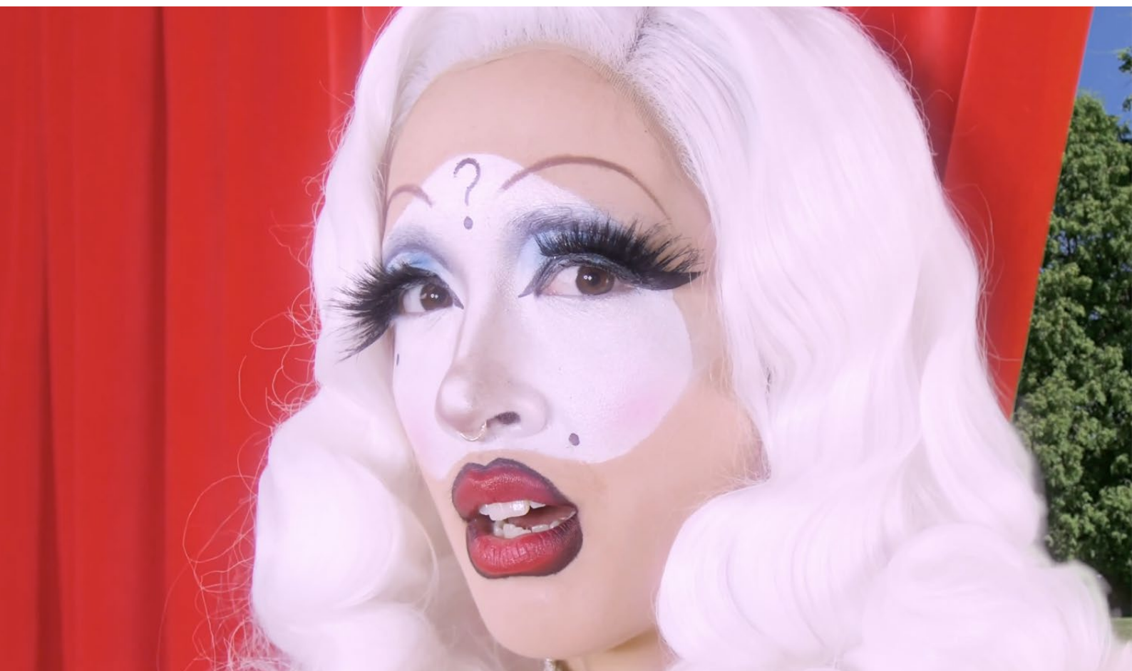
Created from the process of character development for the work Irreconcilable Differences , premiered at ICA London in December 2020.