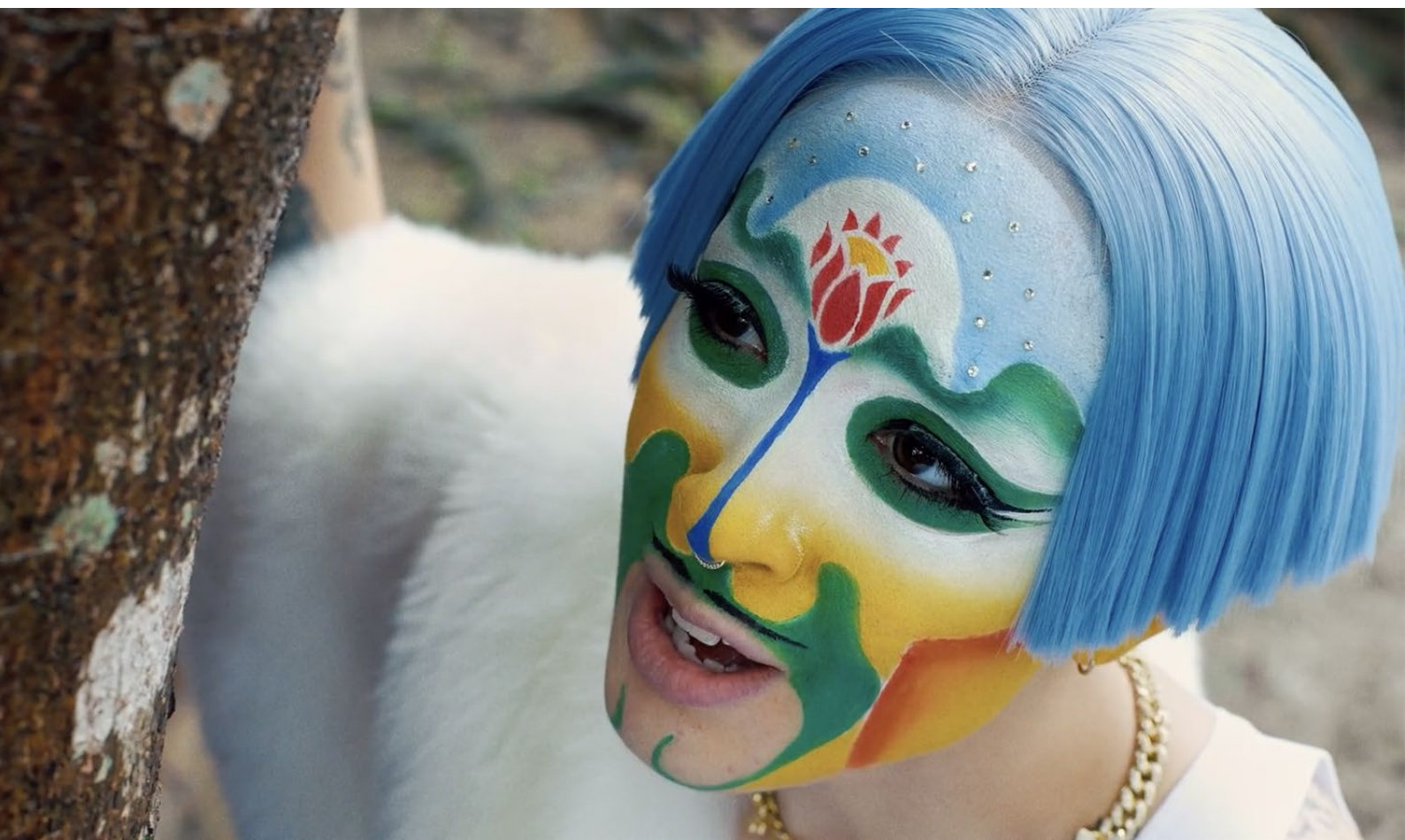
Created from the process of character development for the work A Dream of Wholeness in Parts , commissioned by the British Art Show 2021 as part of its program.