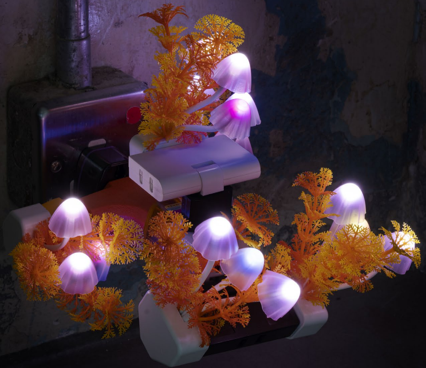
Night Mushroom Colon (Five)