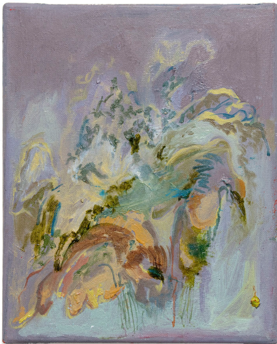
Bonfire 2 《篝火 二》