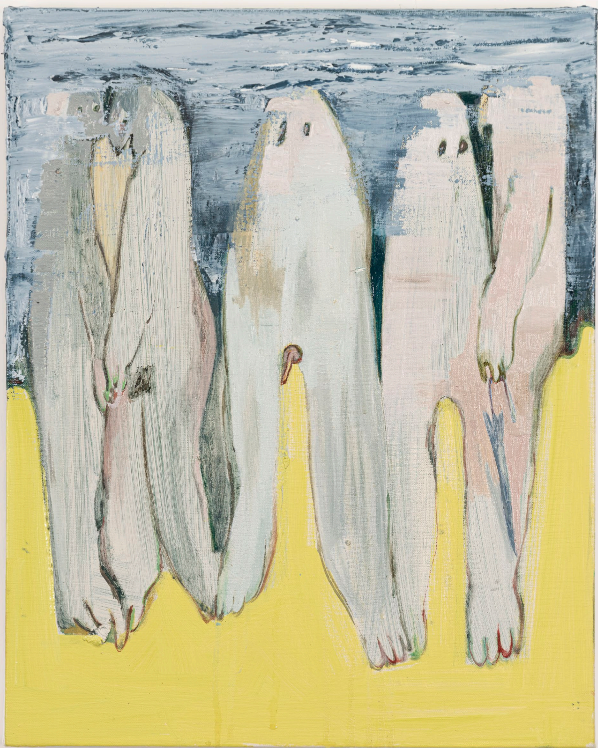
Invincible Sacred Armor 《無敵的聖衣》