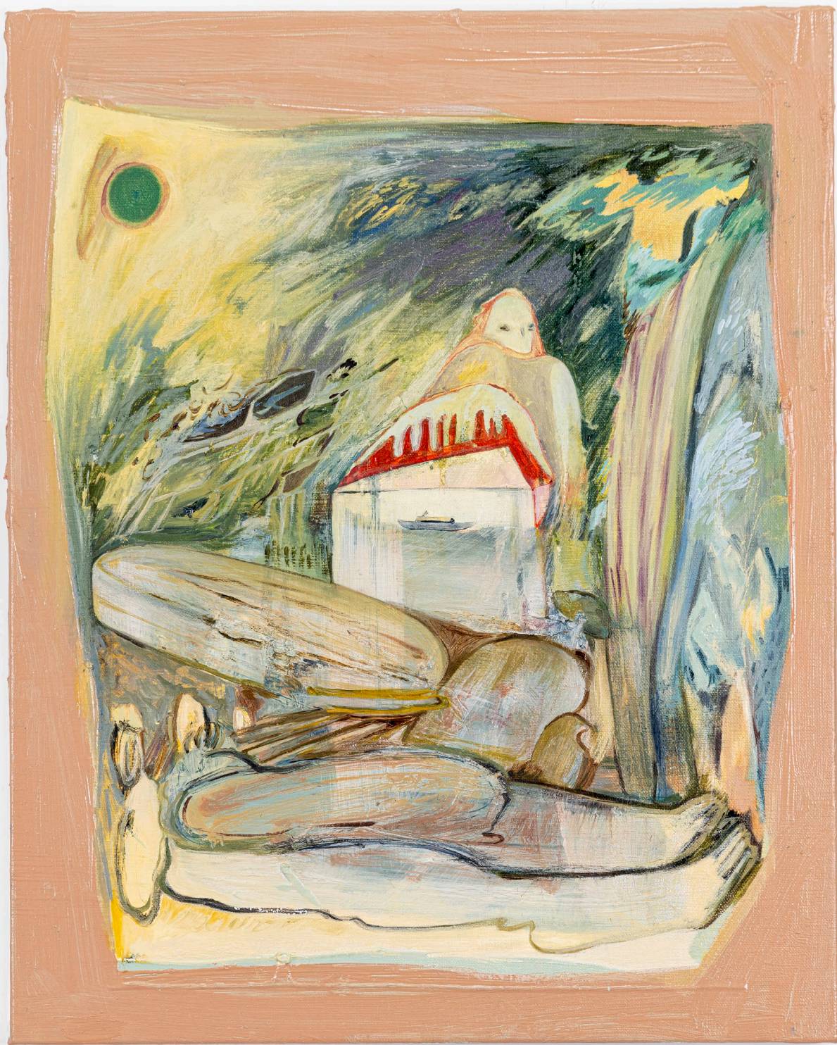
In the name of the moon, I'll punish you 《我要代表月亮懲罰你》