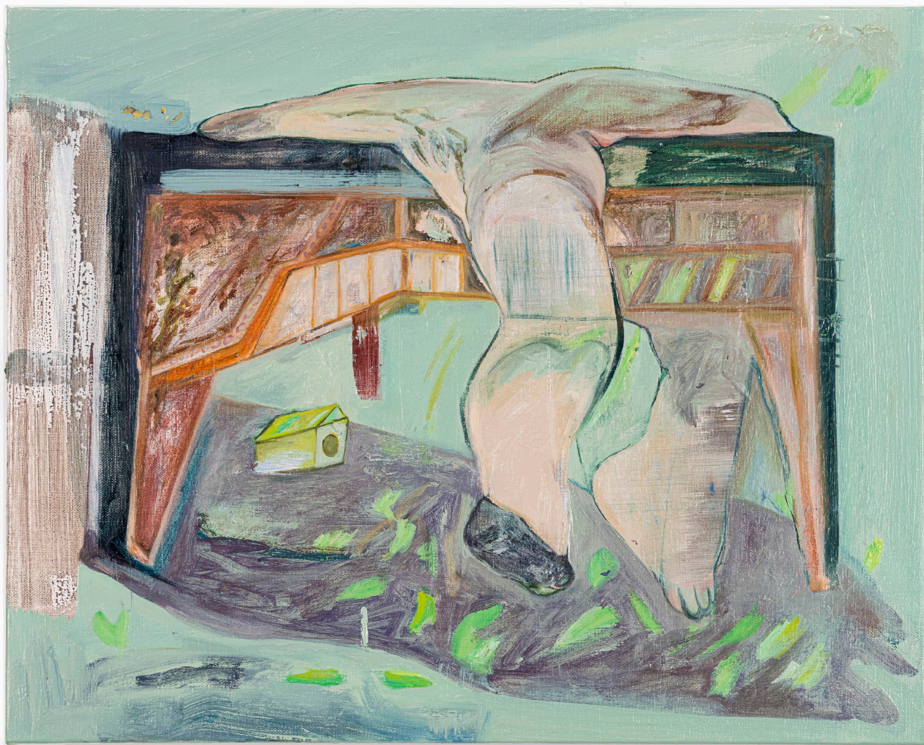
Tired, Tired 《边la边la》