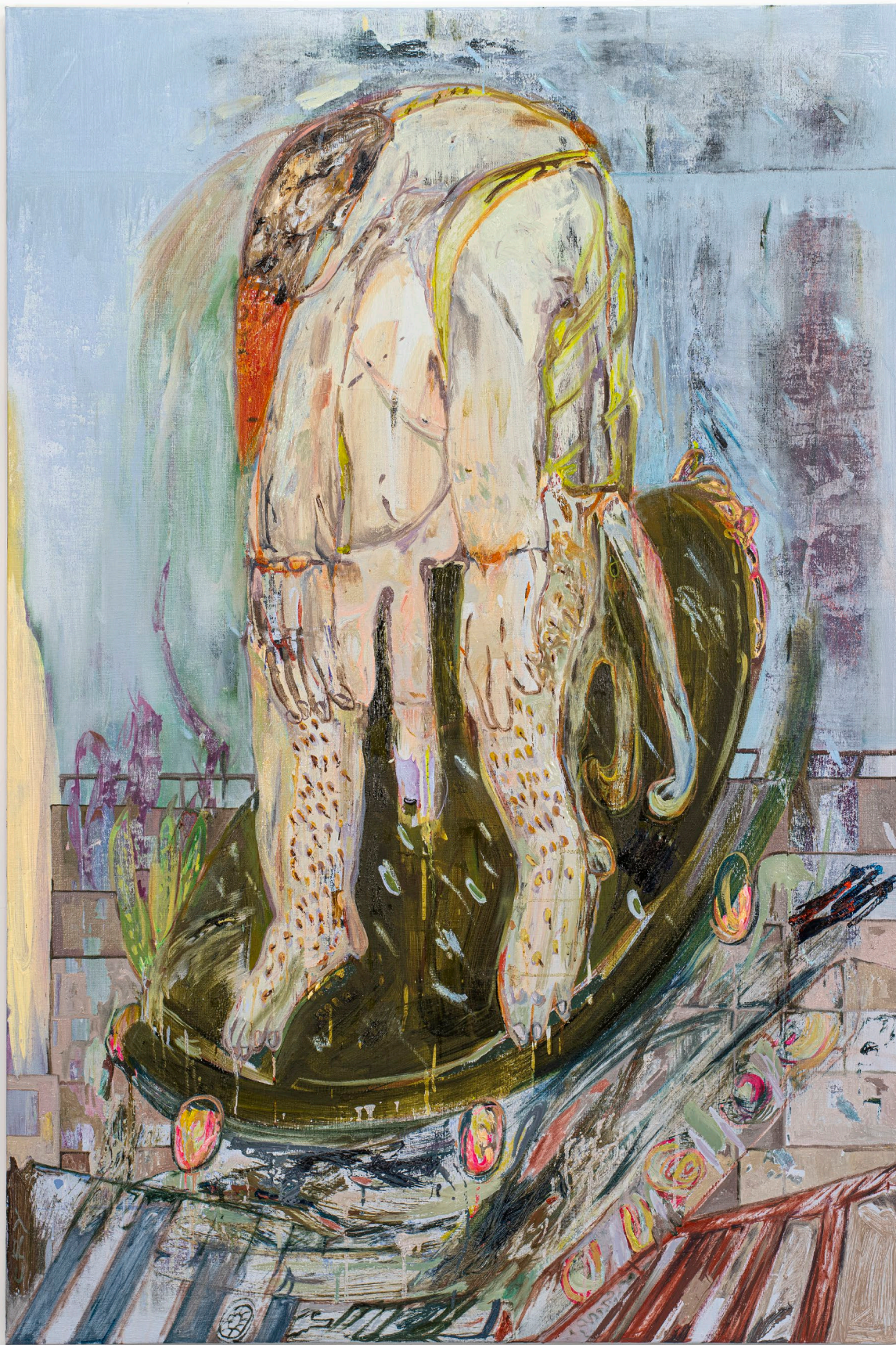
Memory stretches as long as a rail 《記憶像鐵軌一樣長》