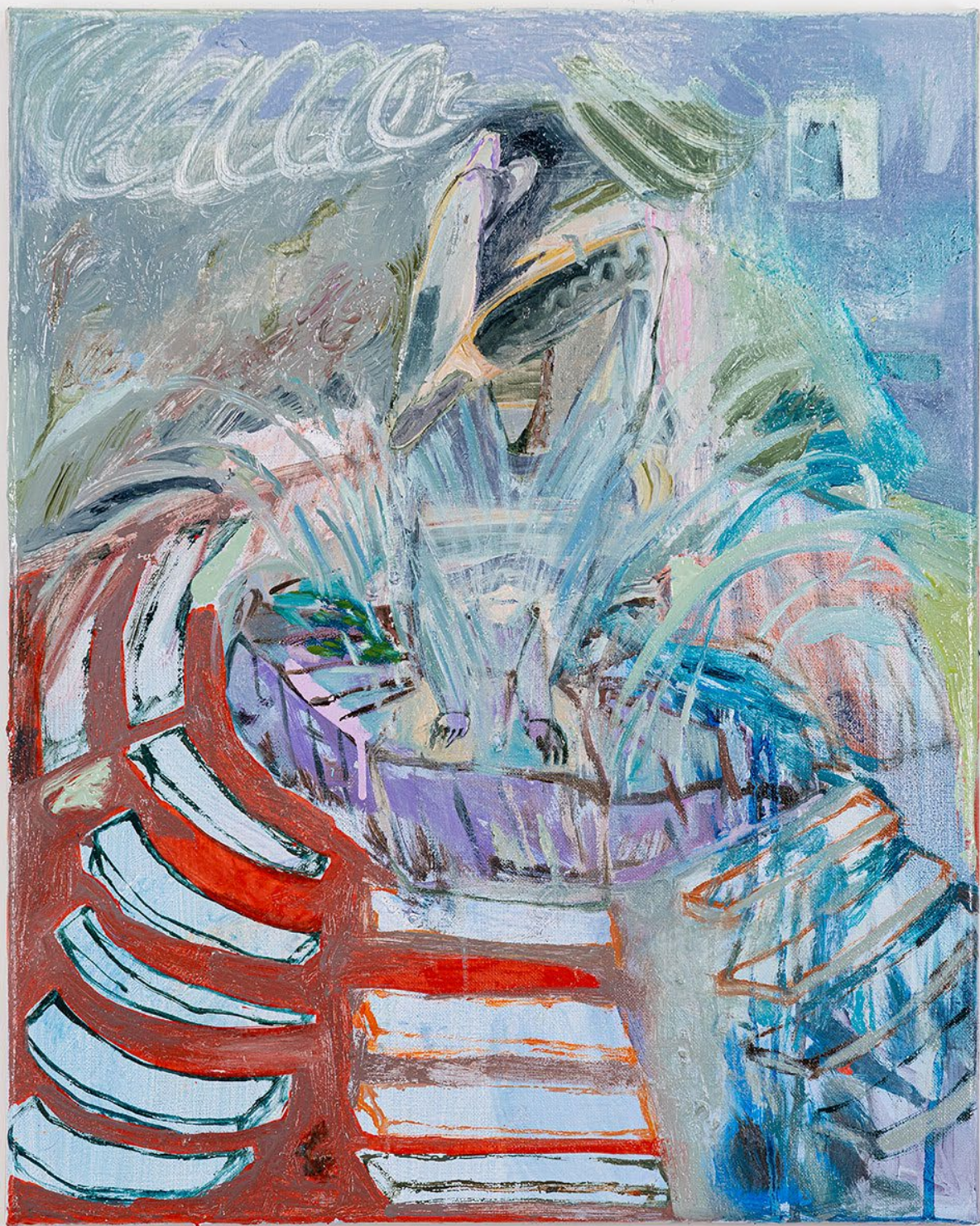
Setting a trap for you 《送你落局》