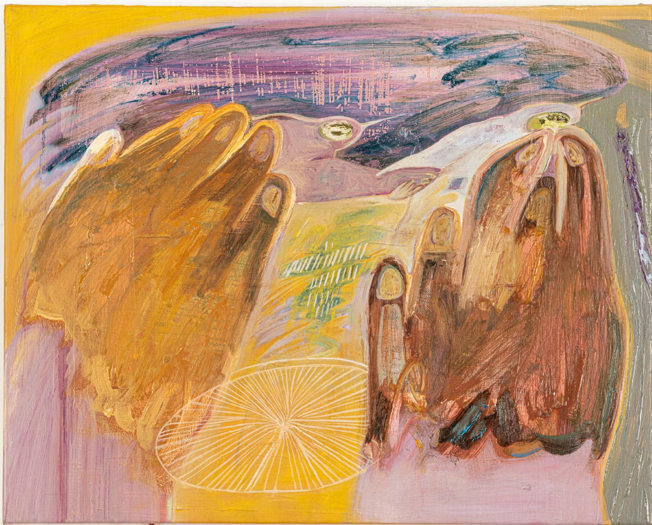
Sea of Suffering 《苦海》