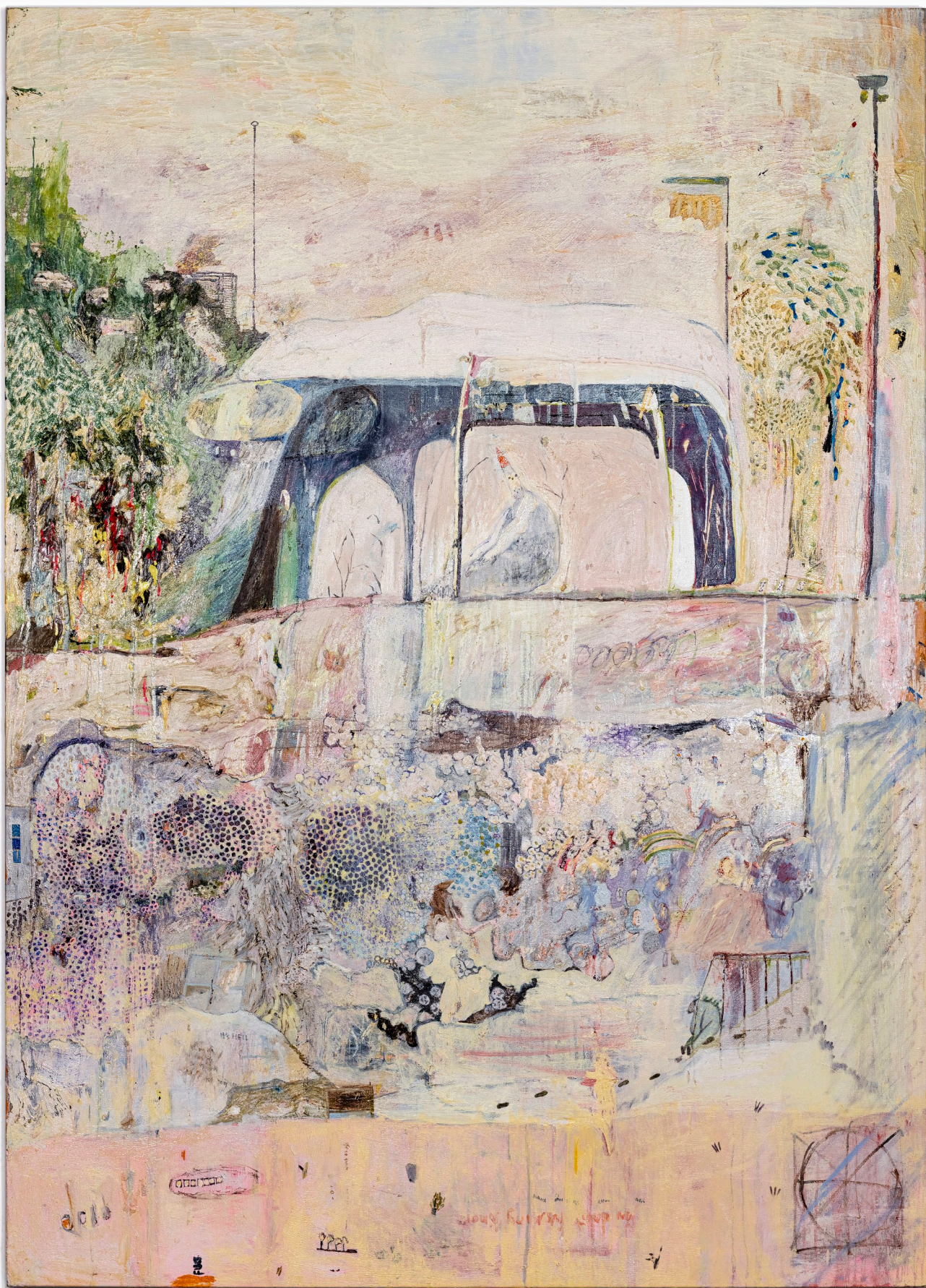
Happy Birthday to Me 《祝我生日快樂》