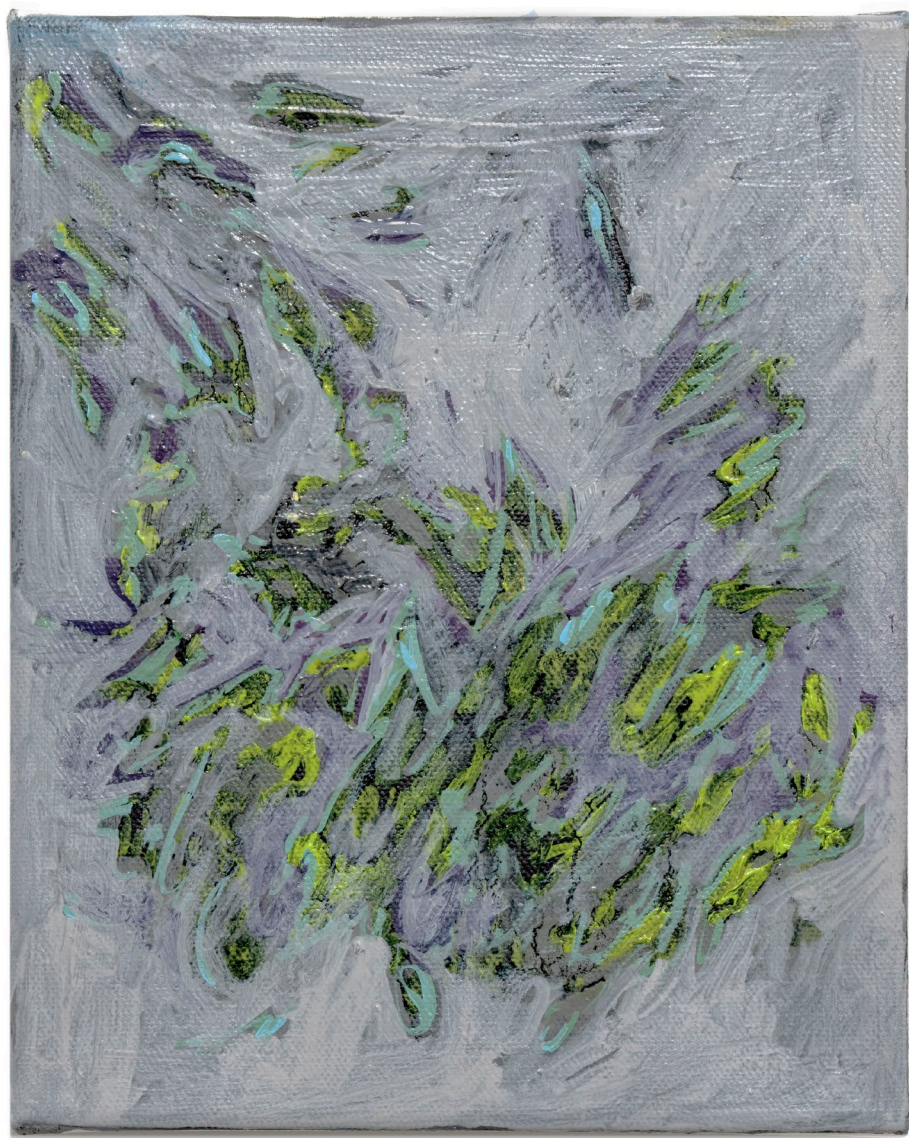
Bonfire 1 《篝火 一》