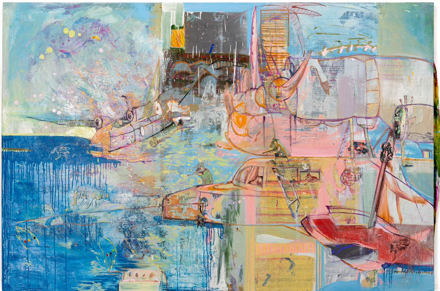
Searching for hand hand 《偵緝手手》