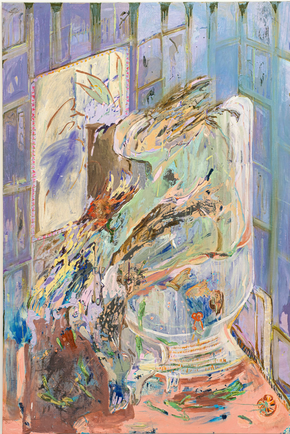
Beer, Weed and Spinach 《啤酒、大麻和菠菜》