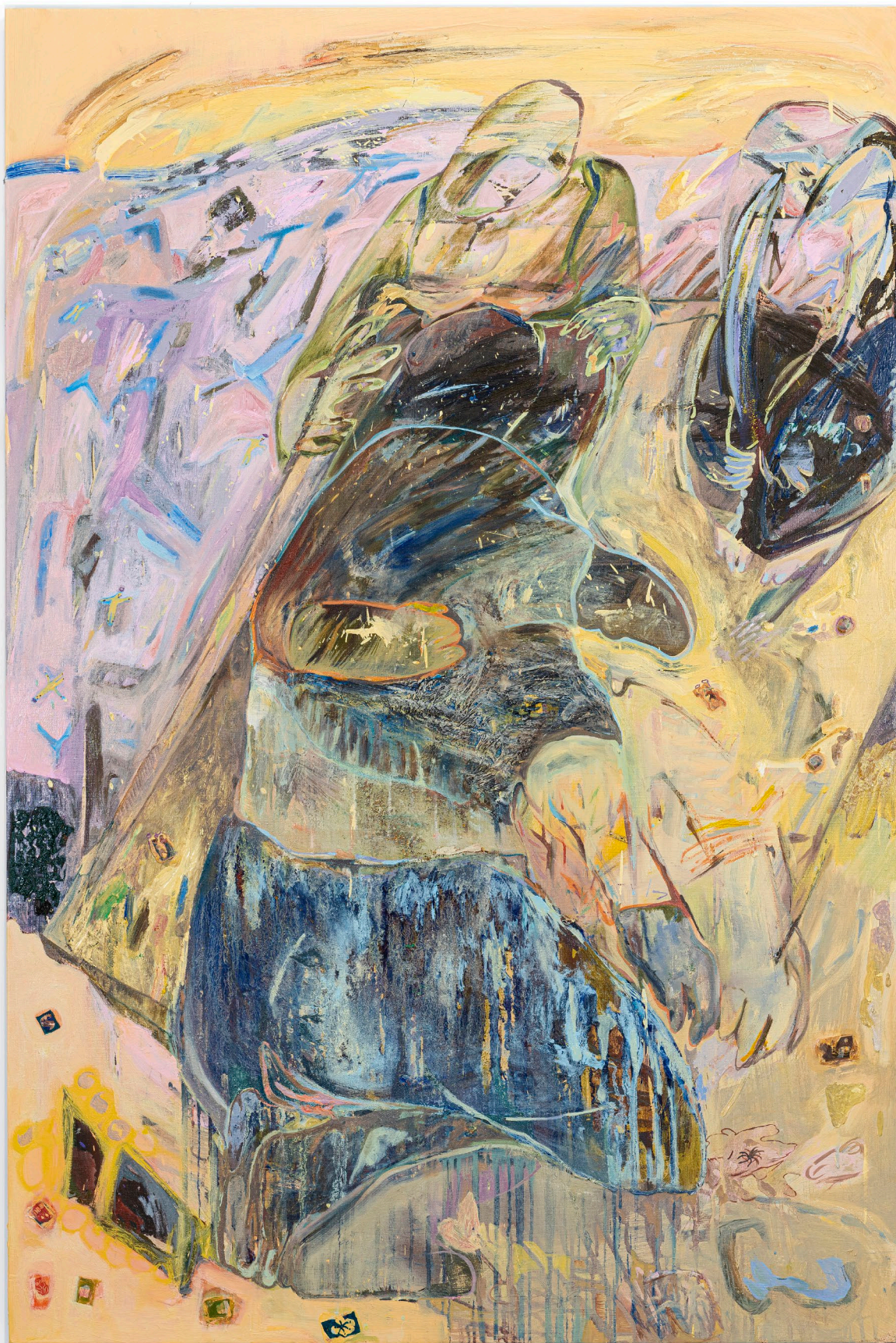
Teenage girls with bricks 《嘸妹挖磚》