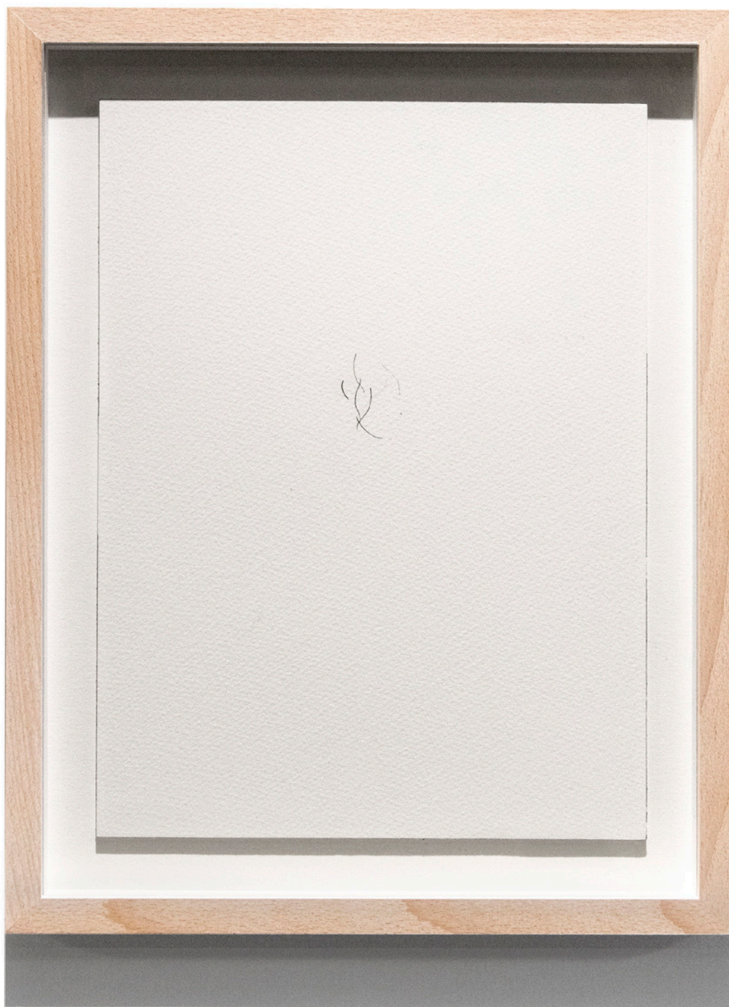
seven layers practice 1.1 《七層練習1.1》