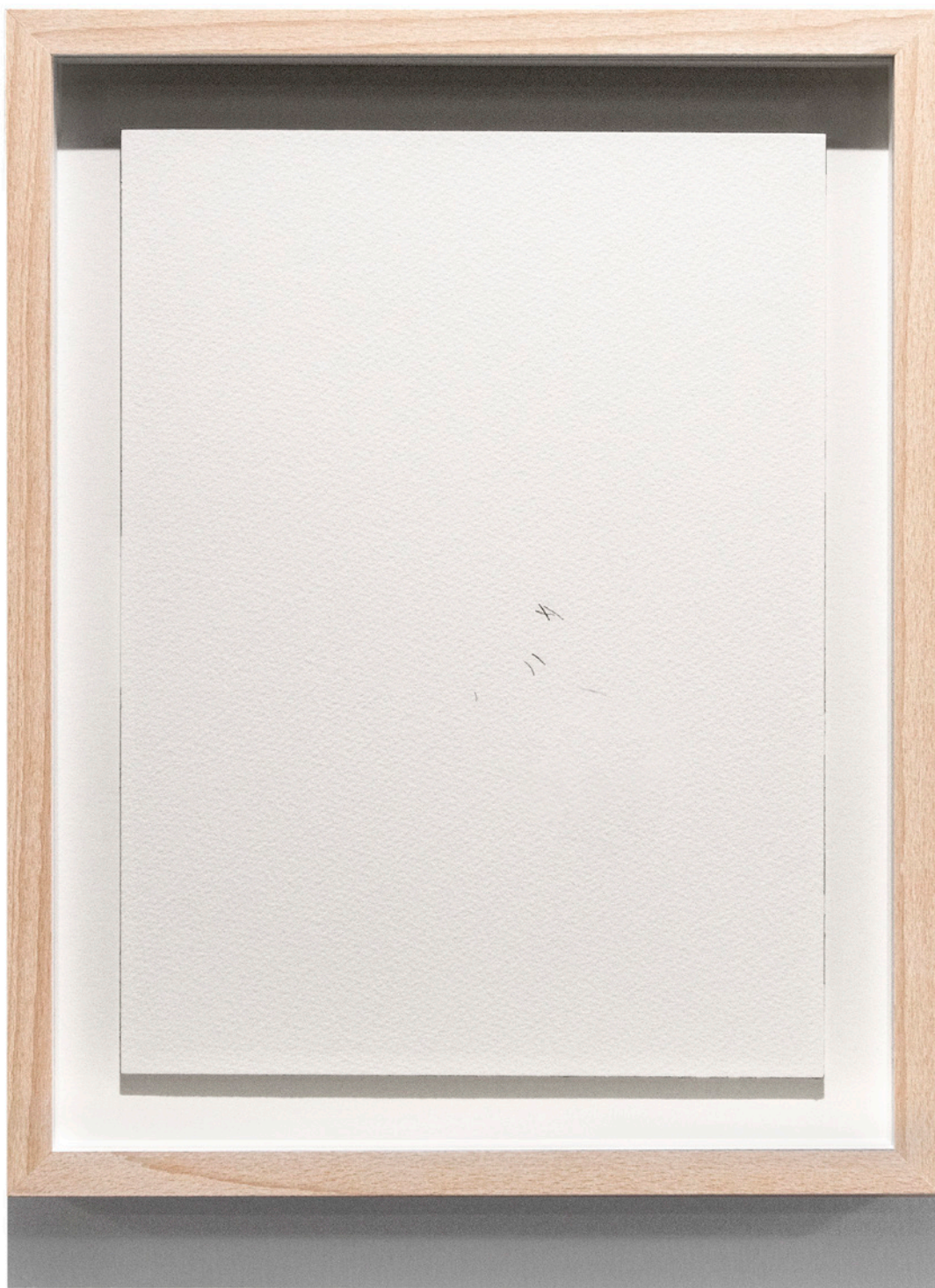
seven layers practice 1.6 《七層練習1.6》