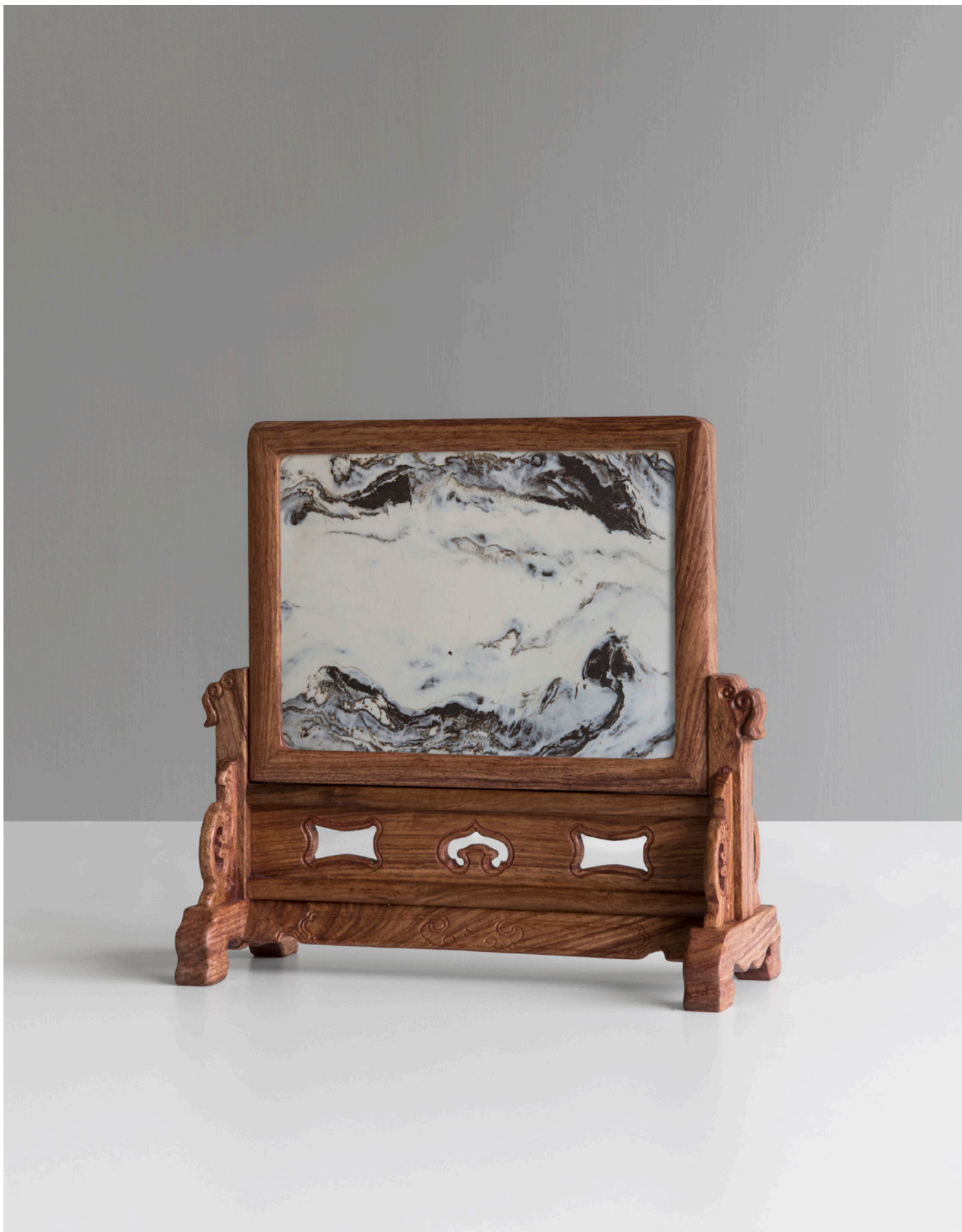
The borrowed relief (marble of soil 04) 《借回來的安慰（土圖04）》 2018

White porcelain, black stoneware, wooden stand / 白瓷、黑粘土、木座 26.8 x 28.5 x 11.7 cm