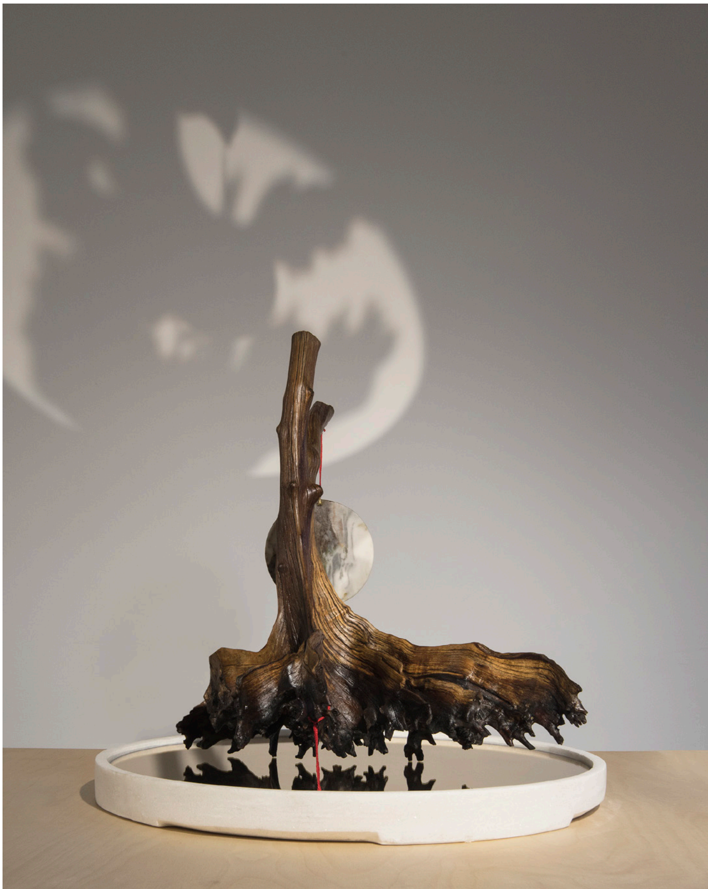
The borrowed relief (moon of home) 《借回來的安慰（明月光）》