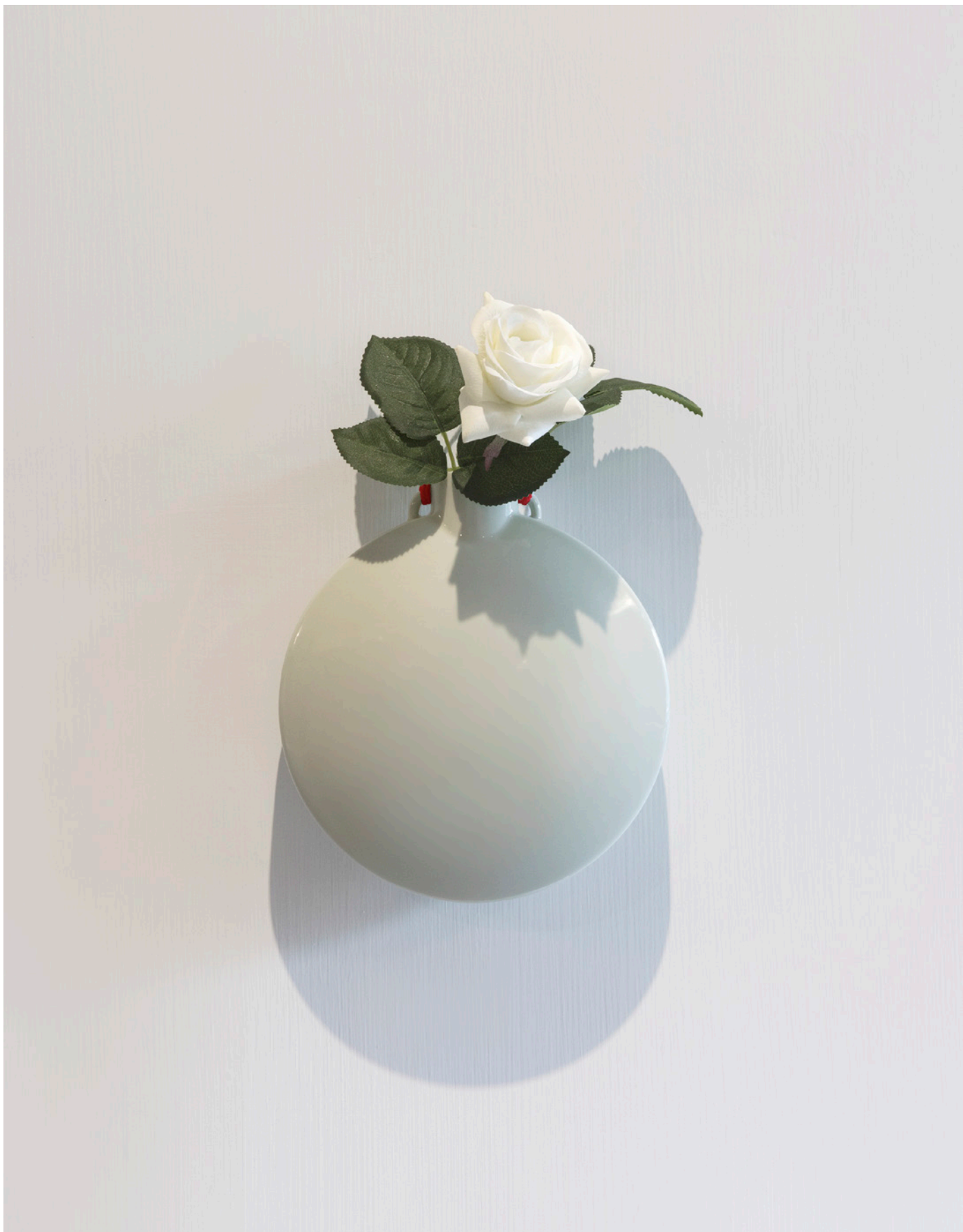
Pigeon Wings (Single Rose) 《鴿翼（一枝玫瑰）》 2018

Synthetic flower, porcelain, string / 絲花、瓷、繩 31 x 19 x 6 cm