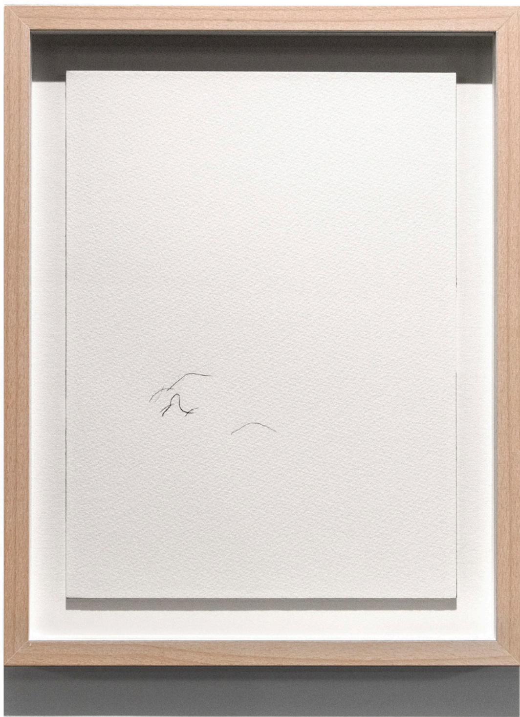
seven layers practice 1.2 《七層練習1.2》