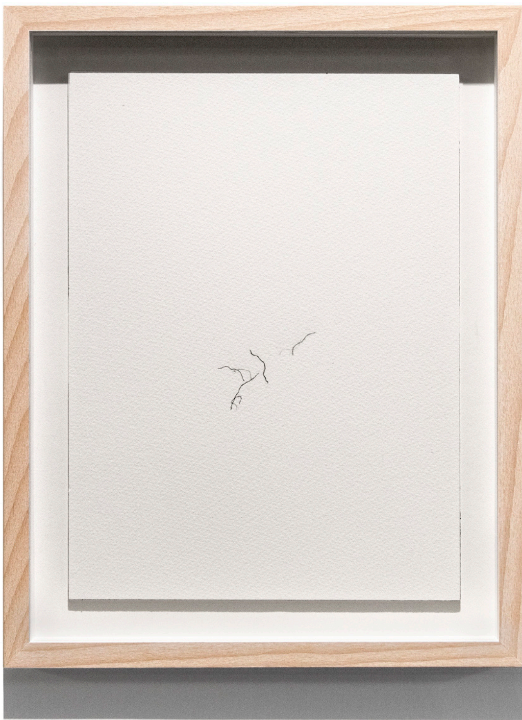
seven layers practice 1.5 《七層練習1.5》