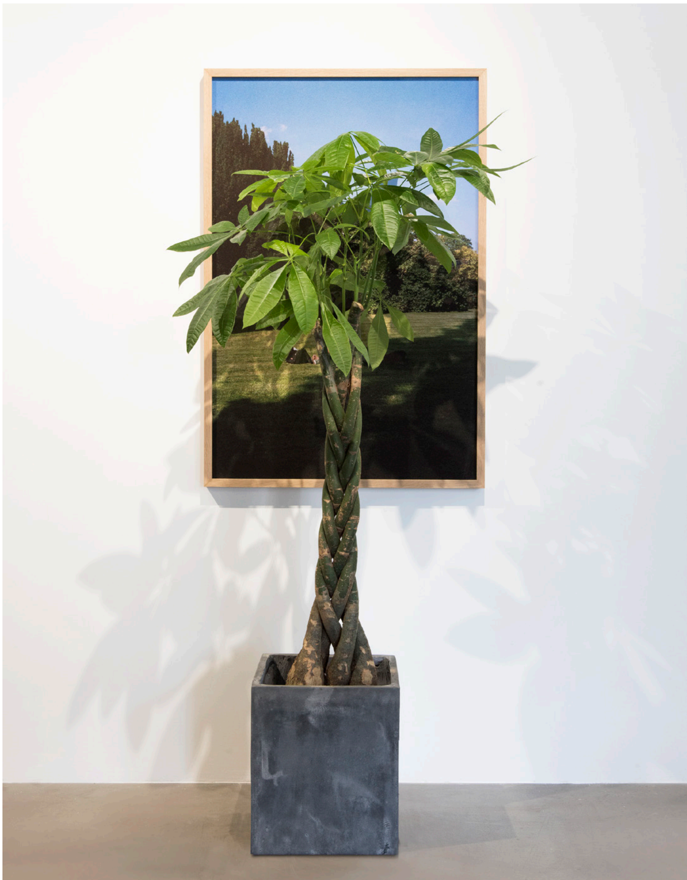
Garden Sitters (The world is burning) 《公園看更（世界正焚毀）》