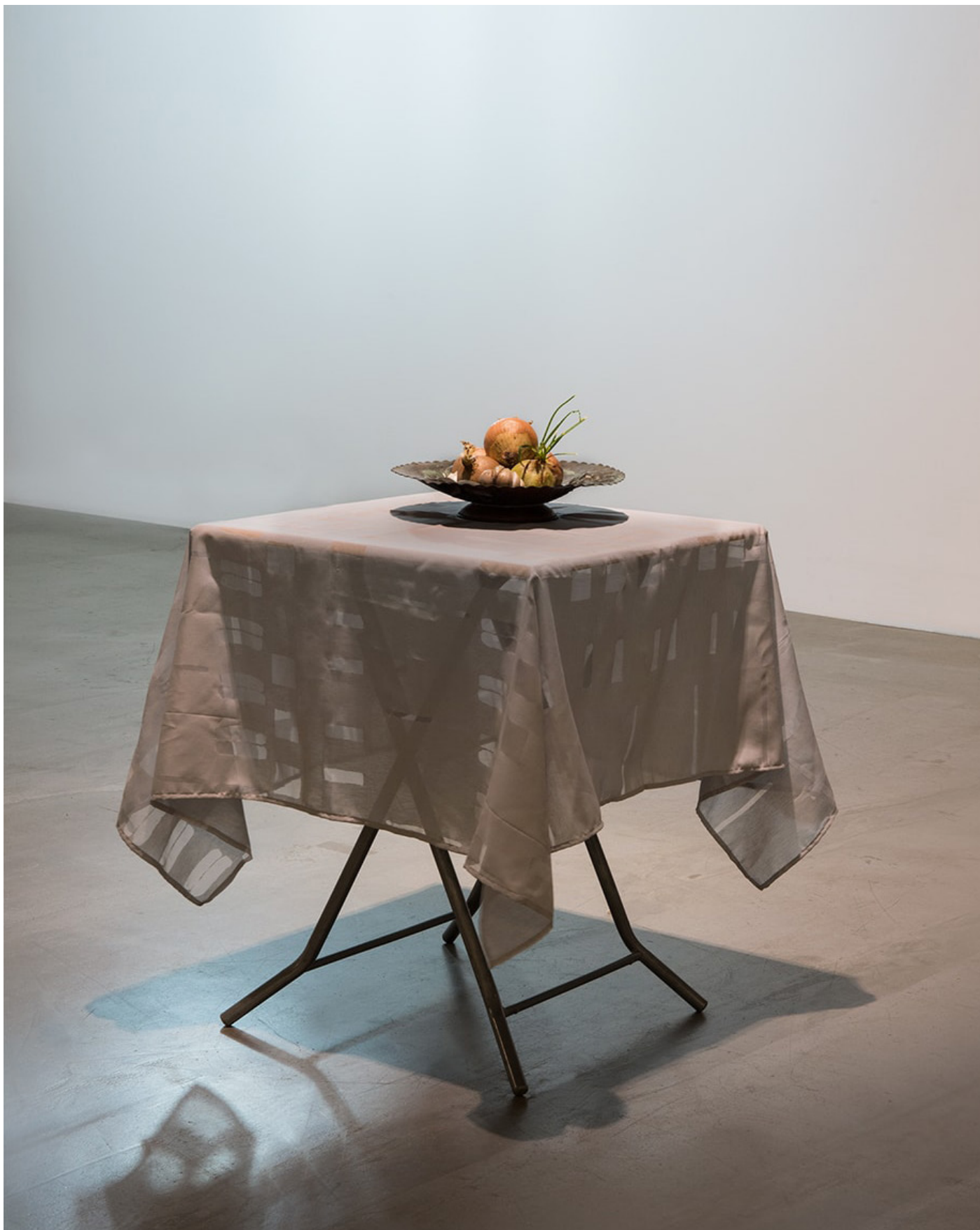
growing onions 《生長中的洋蔥》