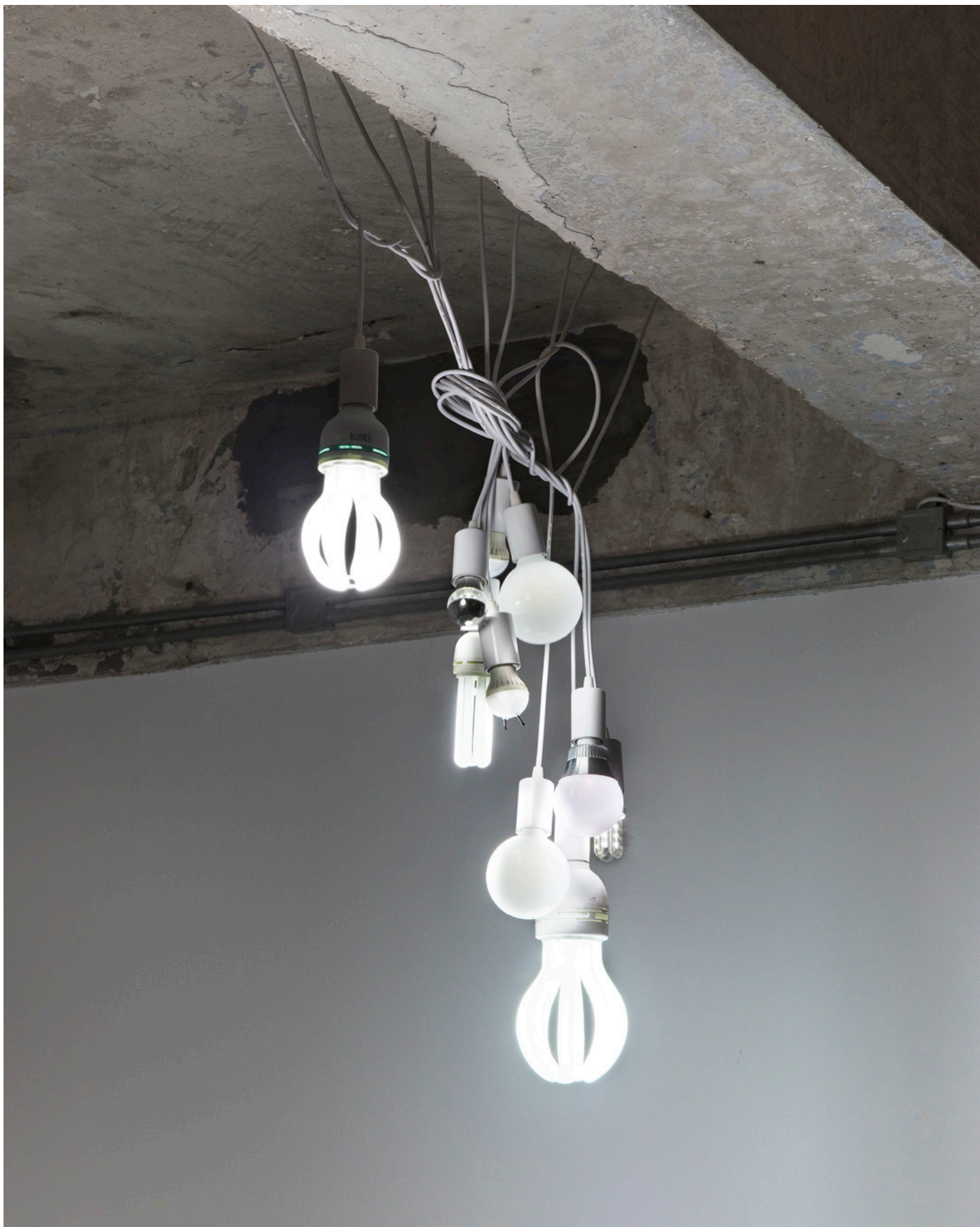
Chaotic suns (white) 《混亂太陽群(白)》