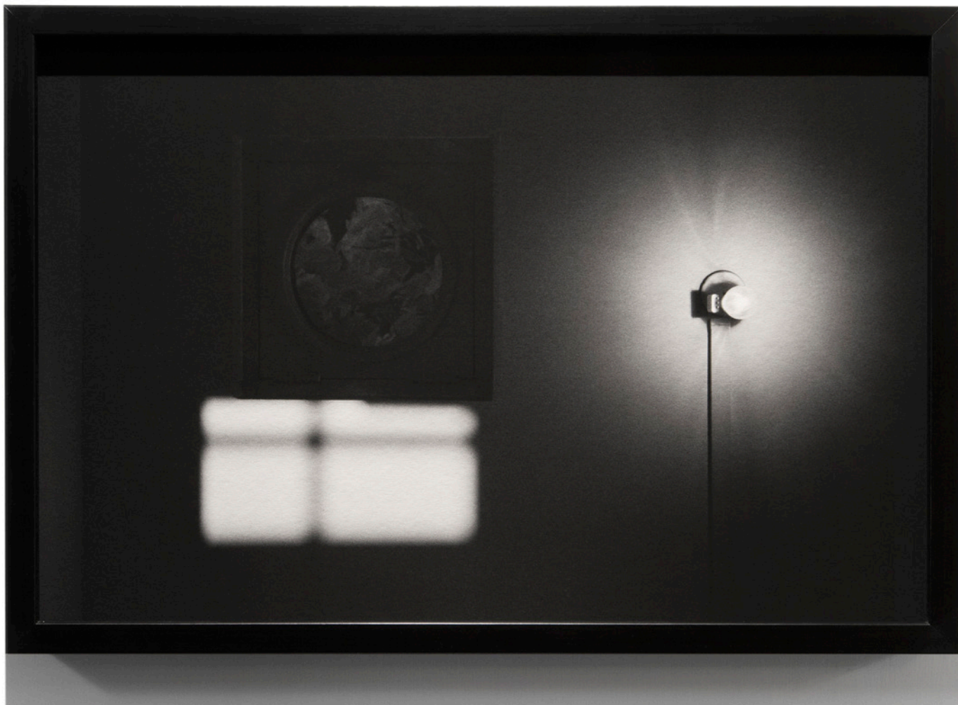
Back window with front shadow 《前影後窗》