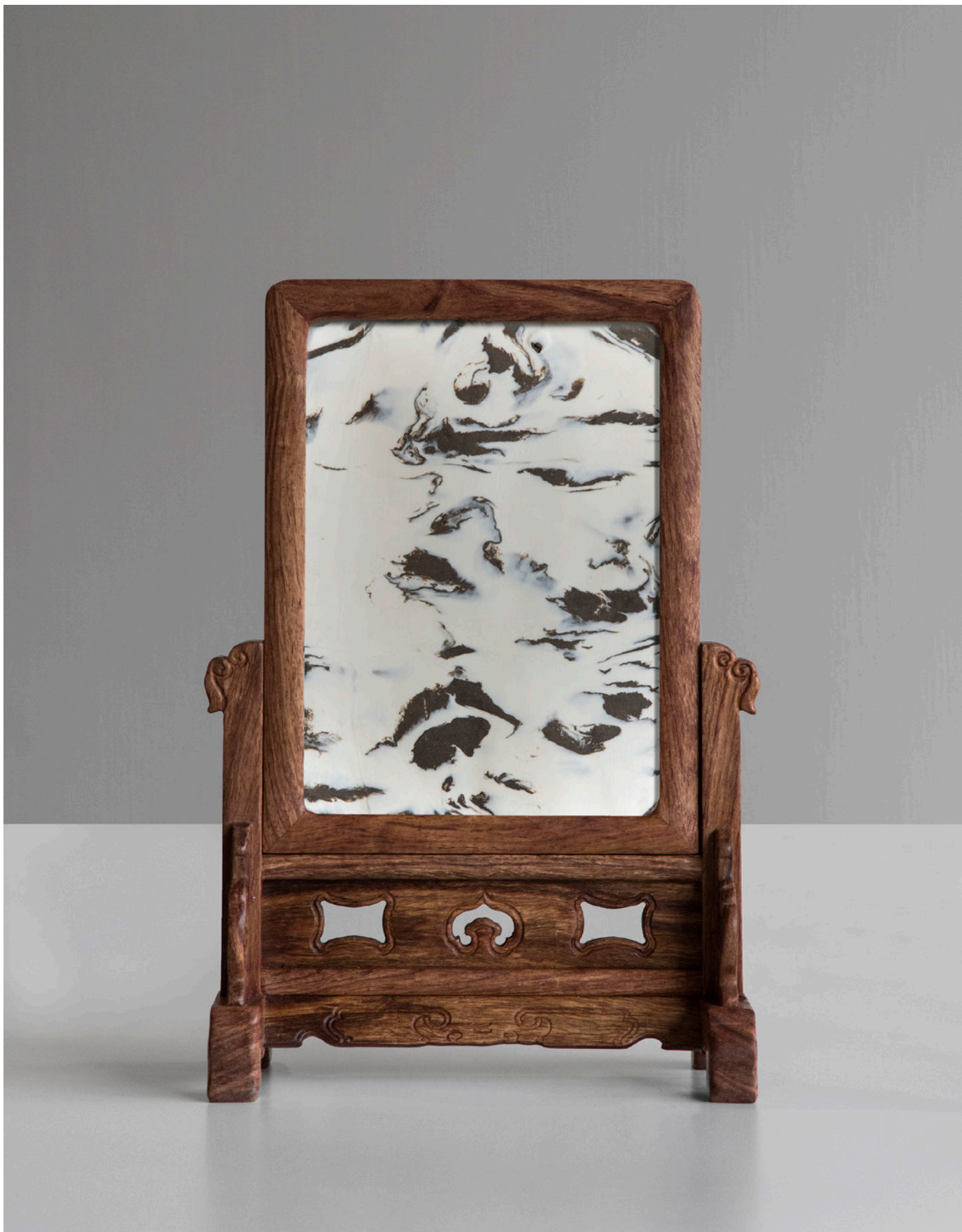
The borrowed relief (marble of soil 01) 《借回來的安慰（土圖01）》 2018

White porcelain, black stoneware, wooden stand / 白瓷、黑粘土、木座 33 x 22.8 x 11.5 cm