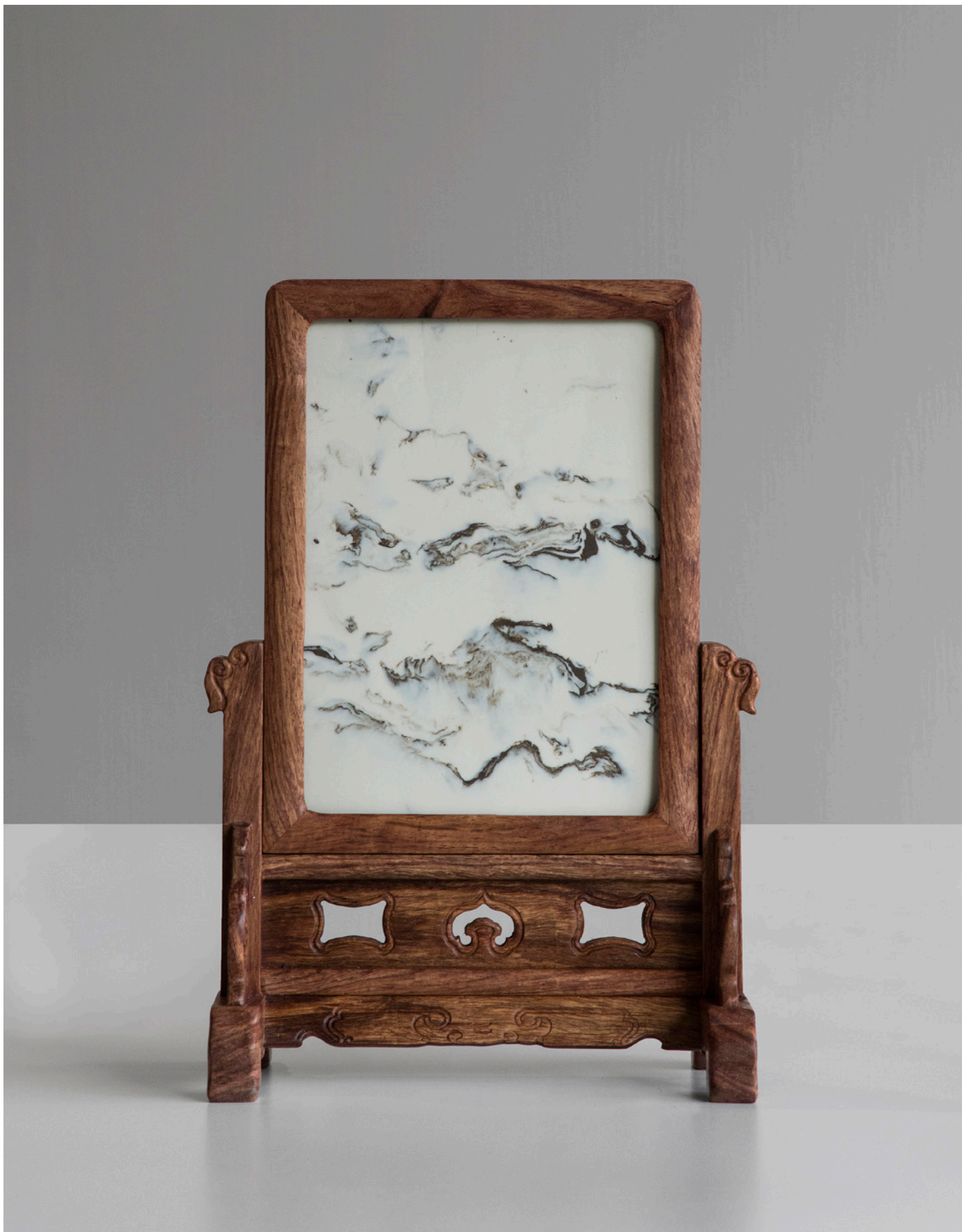
The borrowed relief (marble of soil 03) 《借回來的安慰（土圖03）》 2018

White porcelain, black stoneware, wooden stand / 白瓷、黑粘土、木座 33 x 22.8 x 11.5 cm