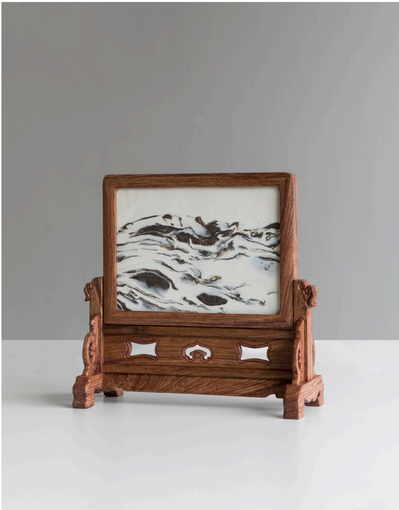
The borrowed relief (marble of soil 02) 《借回來的安慰（土圖02）》 2018

White porcelain, black stoneware, wooden stand / 白瓷、黑粘土、木座 26.8 x 28.5 x 11.7 cm