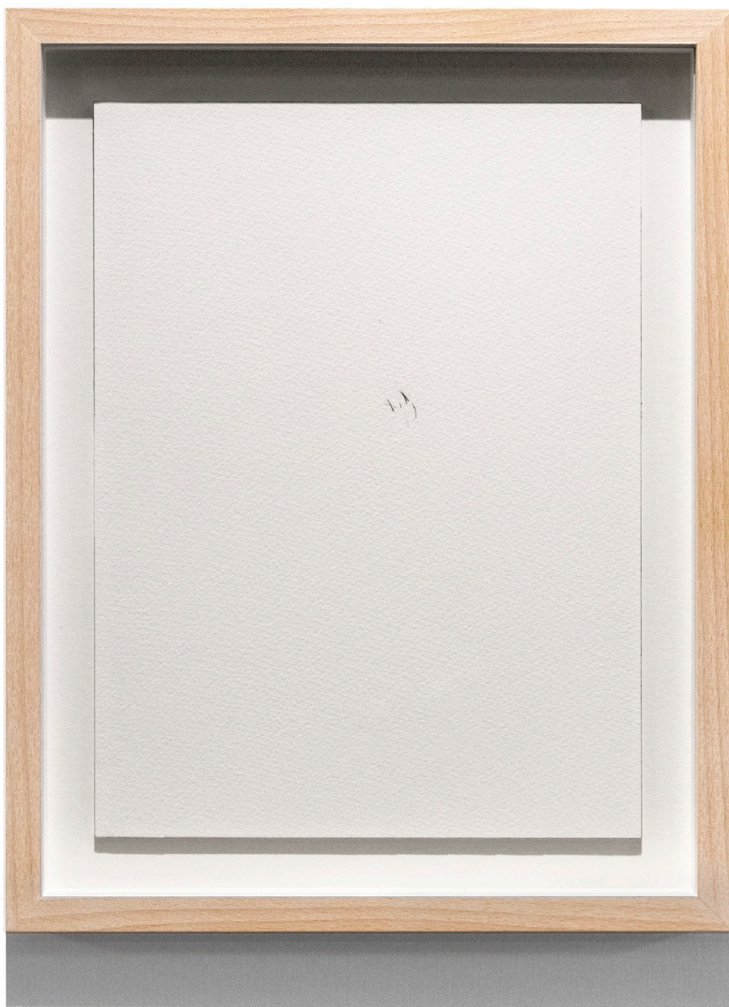
seven layers practice 1.4 《七層練習1.4》