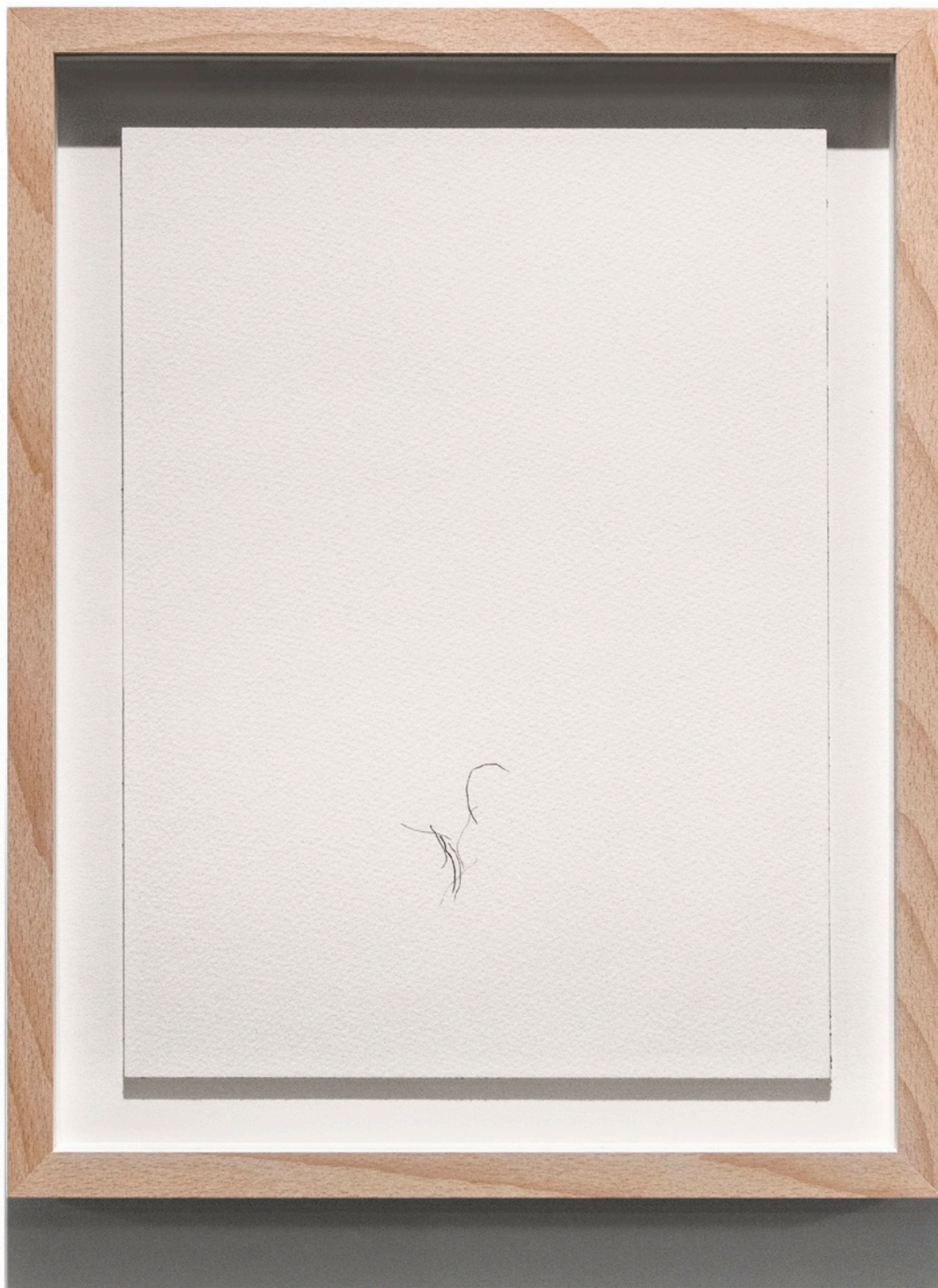
seven layers practice 1.3 《七層練習1.3》