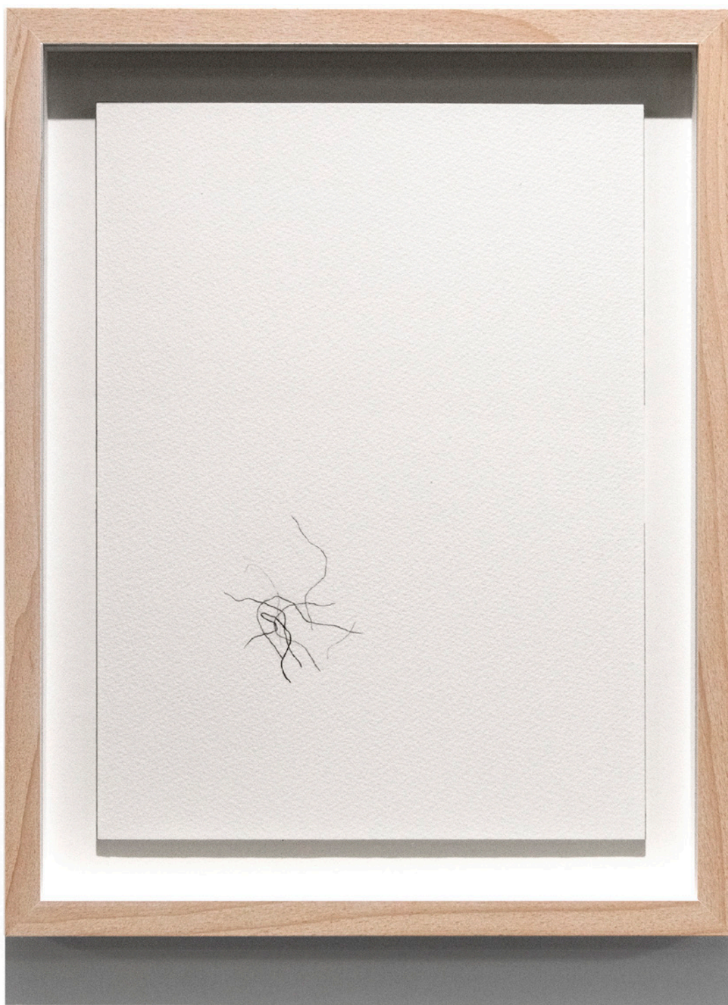
seven layers practice 1.7 《七層練習1.7》