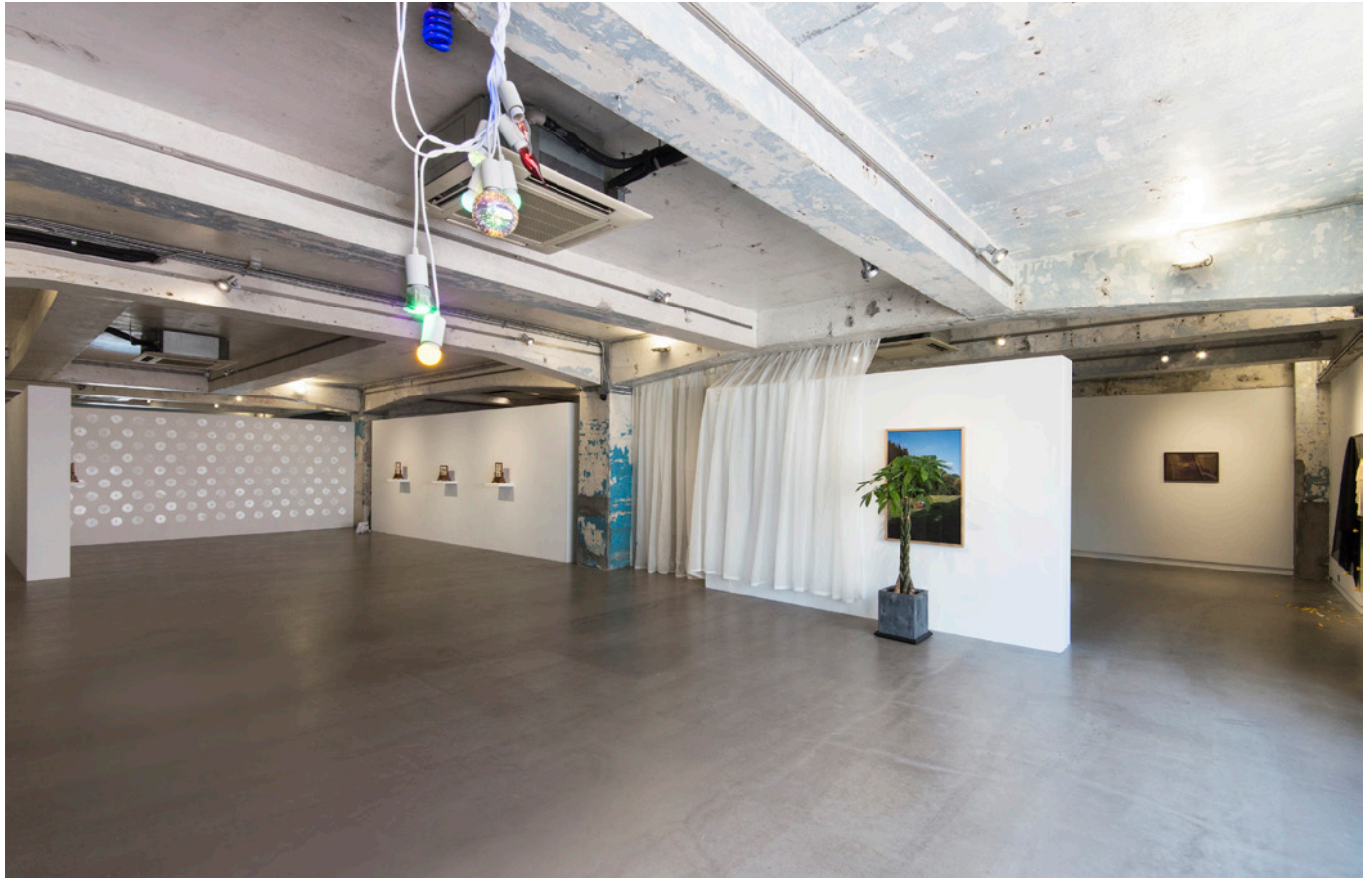
Installation shots 佈展圖