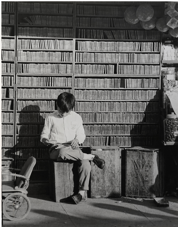
邱良，《公仔書櫃的男孩》，香港，1960年代

香港攝影家邱良(1941-1997)，曾於香港著名的邵氏片場擔任職業攝影師，為影星僱人拍攝肖像，但他的拍攝題材也體現在他對人文主義和不同社會階層的注視。他經常於街頭捕捉市井風情與庶民生活點滴，拍下許多香港早年的社會影像。邱良以寫實攝影與浪漫風格，紀錄了香港從戰後艱苦的境況逐漸成為東方之珠的時代變貌，道出老香港的軼事。