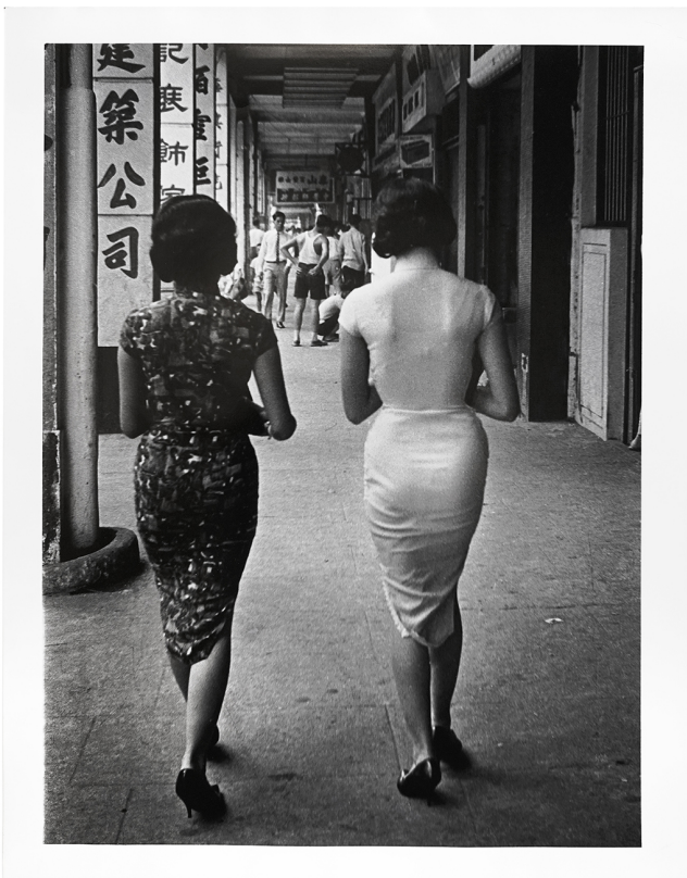
邱良，《僱人行（告士打道）》，香港，1961年

開幕酒會 Opening reception | 2017.11.25. 4pm