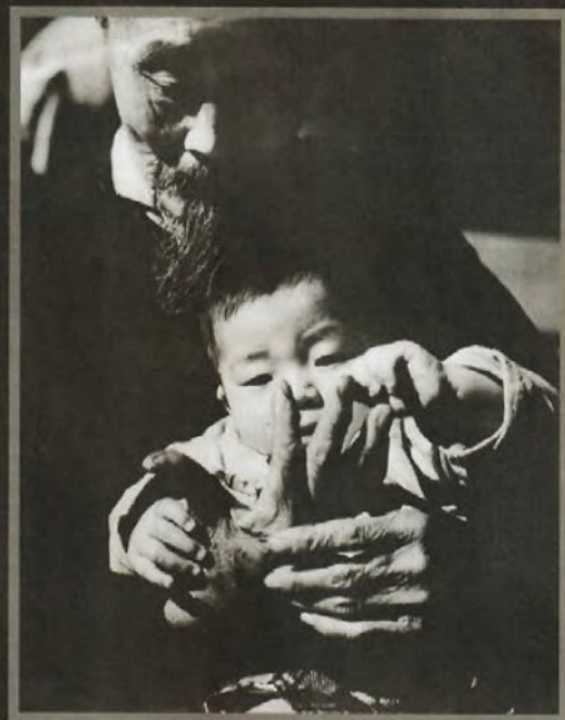
Counting Fingers (Sham Shui Po), 1964