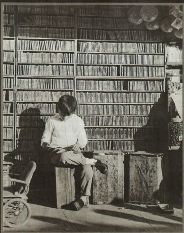
Streetside Library (O'Brien Road, Wan Chai), 1961