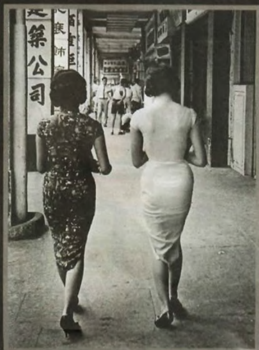
Two Women (Gloucester Road), 1961