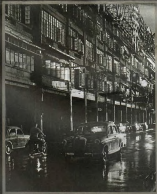
Gloucester Road, 1961

Photographer Yau Leung captured some of the most enduring and evocative images of post-war Hong Kong, and a new exhibition of the late, great artist's work opens in the city today. Regarded as the pre-eminent documentary photographer of his generation, Yau's range of tones and subjects are a high point of the excellently curated collection – mostly from the 1960s – at Blindspot Gallery in Wong Chuk Hang. Yau, who died in 1997 at the age of 56, was as comfortable shooting the common people as he was the rich and famous, while his impeccably composed studies of street life are effortlessly timeless. Each black and white print in the show was developed on silver gelatin paper by Yau himself.