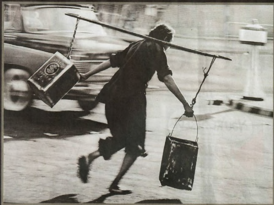
Risking Her Life to Get Water (Sham Shui Po), 1963