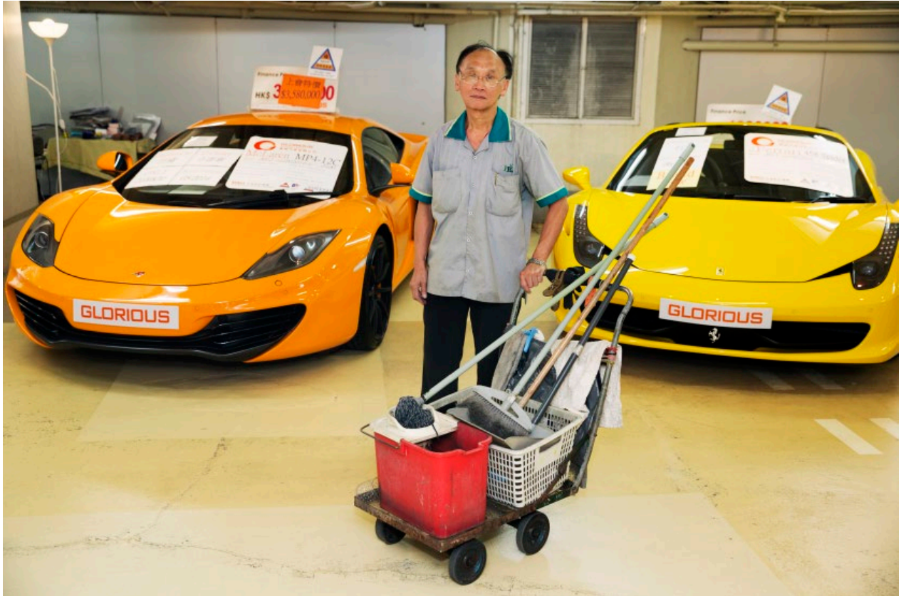
Hong Kong (LON156497) 2013 Pigment print