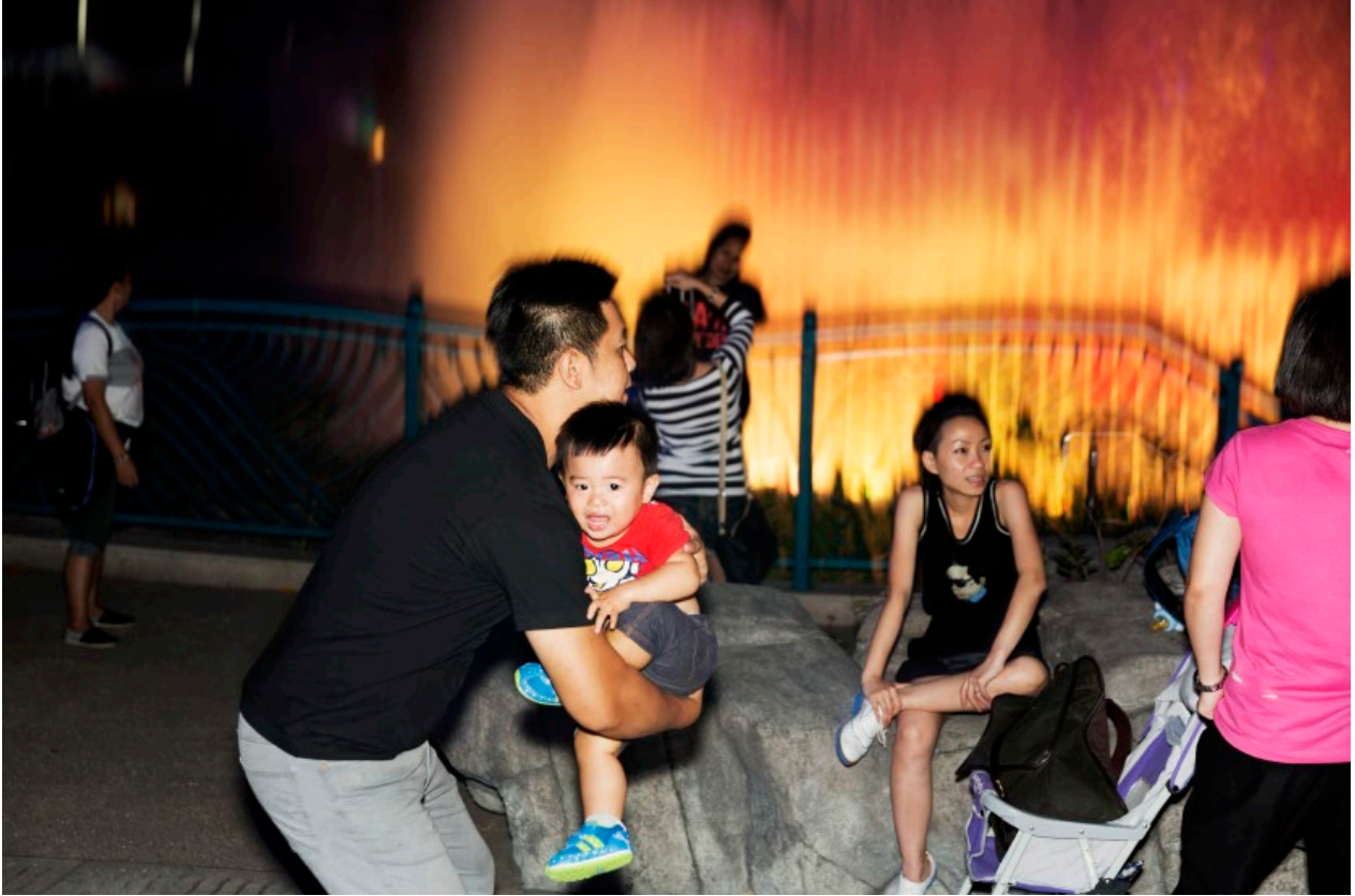
Hong Kong (LON156415) 2013 Pigment print