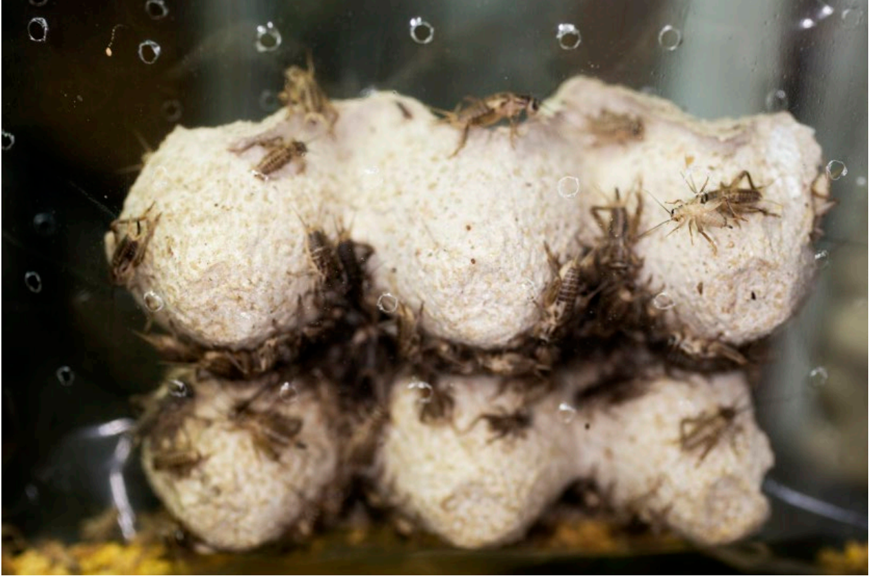
Hong Kong (LON158319) 2013 Pigment print