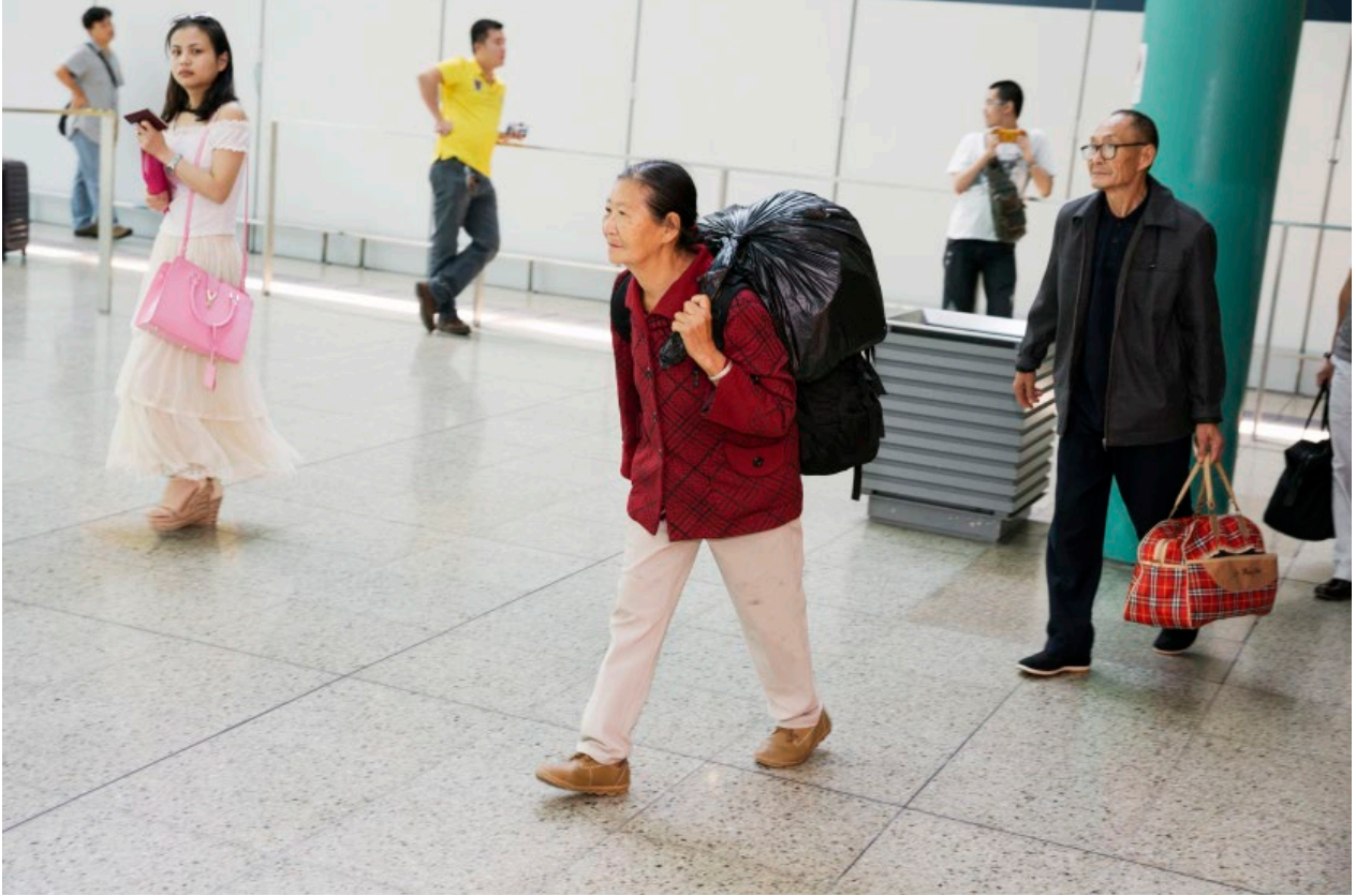
Hong Kong (LON156443) 2013 Pigment print