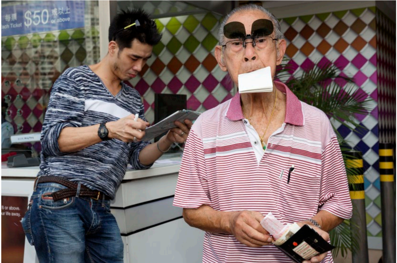
Hong Kong (LON156551) 2013 Pigment print