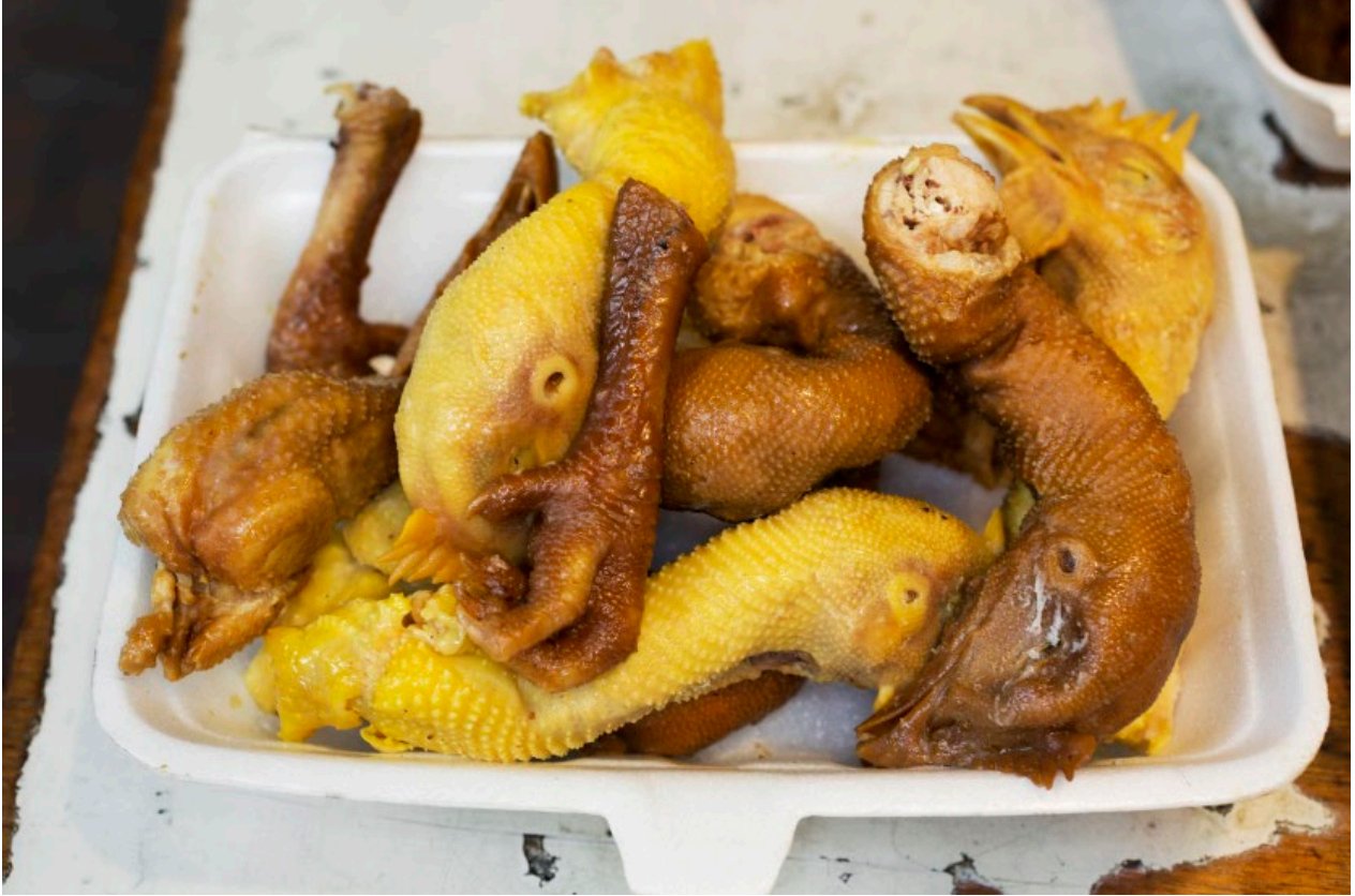
Hong Kong (LON156487) 2013 Pigment print