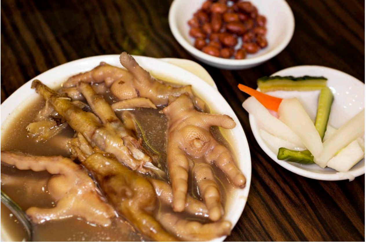
Hong Kong (LON156361) 2013 Pigment print