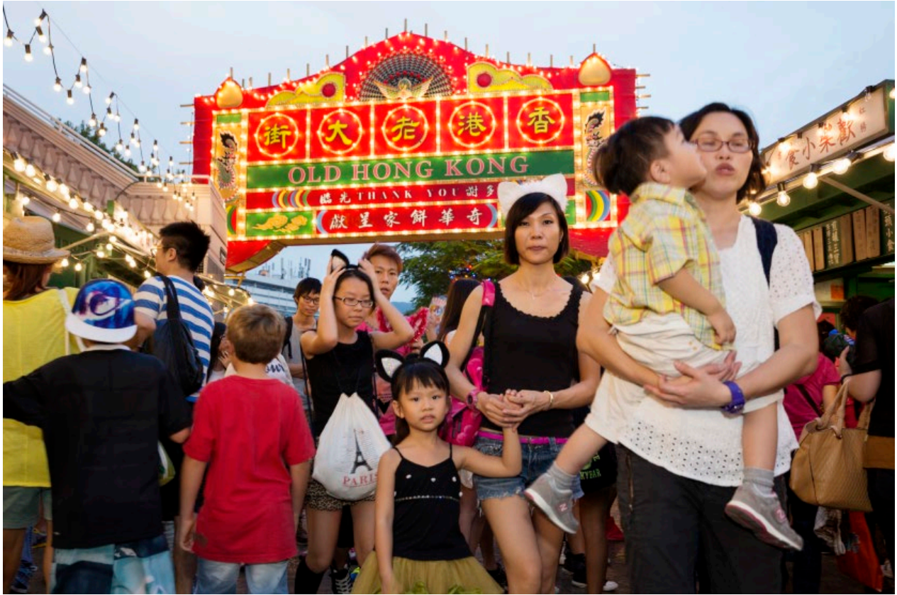
Hong Kong (LON156413) 2013 Pigment print