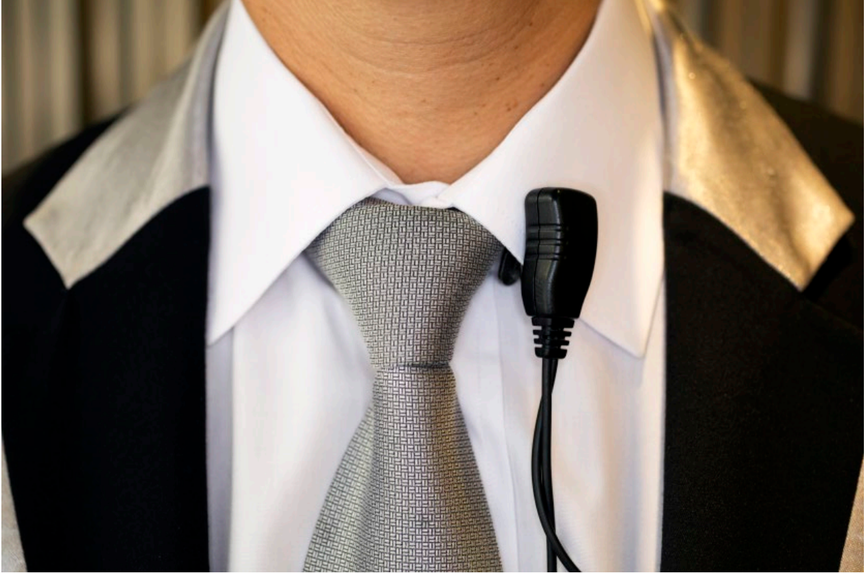
Hong Kong (LON156530) 2013 Pigment print