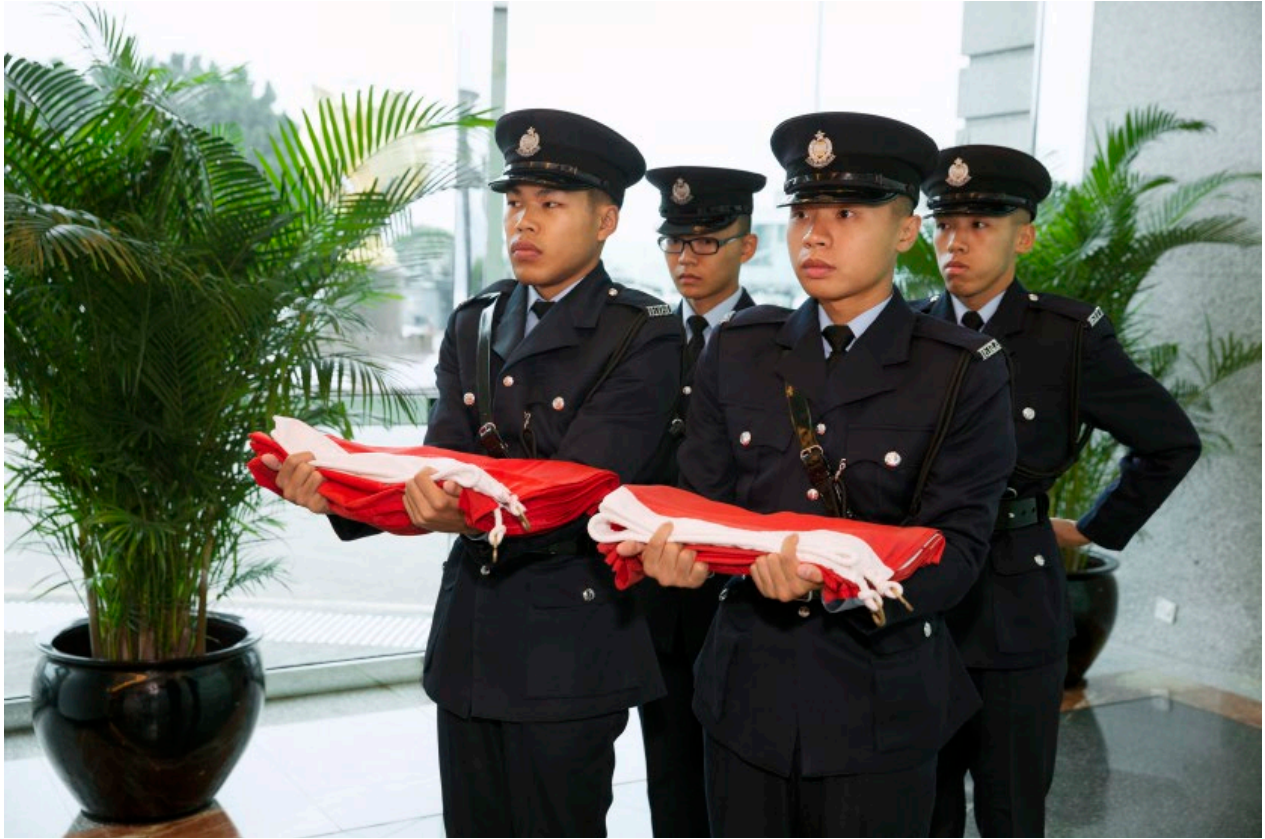
Hong Kong (LON156480) 2013 Pigment print