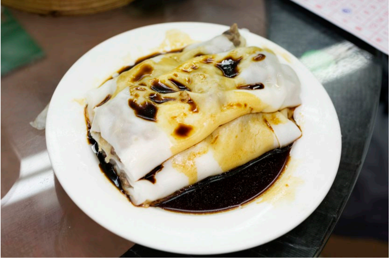
Hong Kong (LON156540) 2013 Pigment print