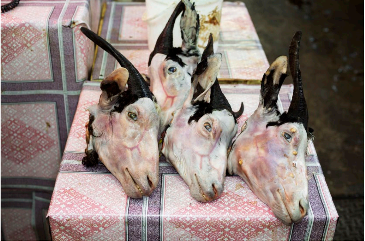
Hong Kong (LON156483) 2013 Pigment print