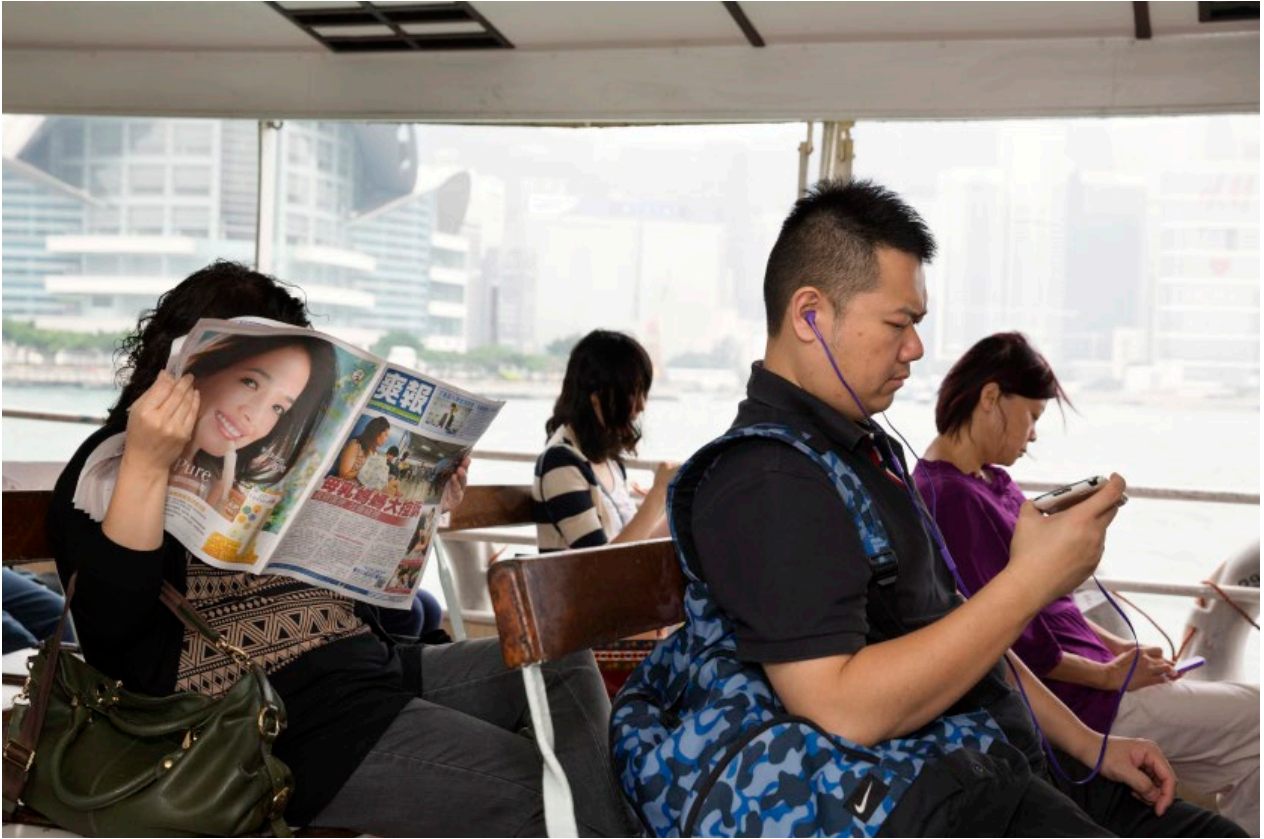
Hong Kong (LON156482) 2013 Pigment print