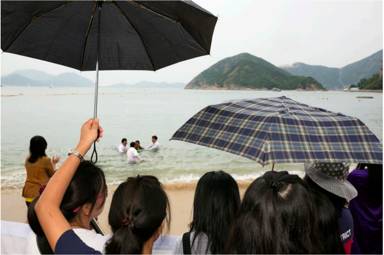
Hong Kong (LON156428) 2013 Pigment print