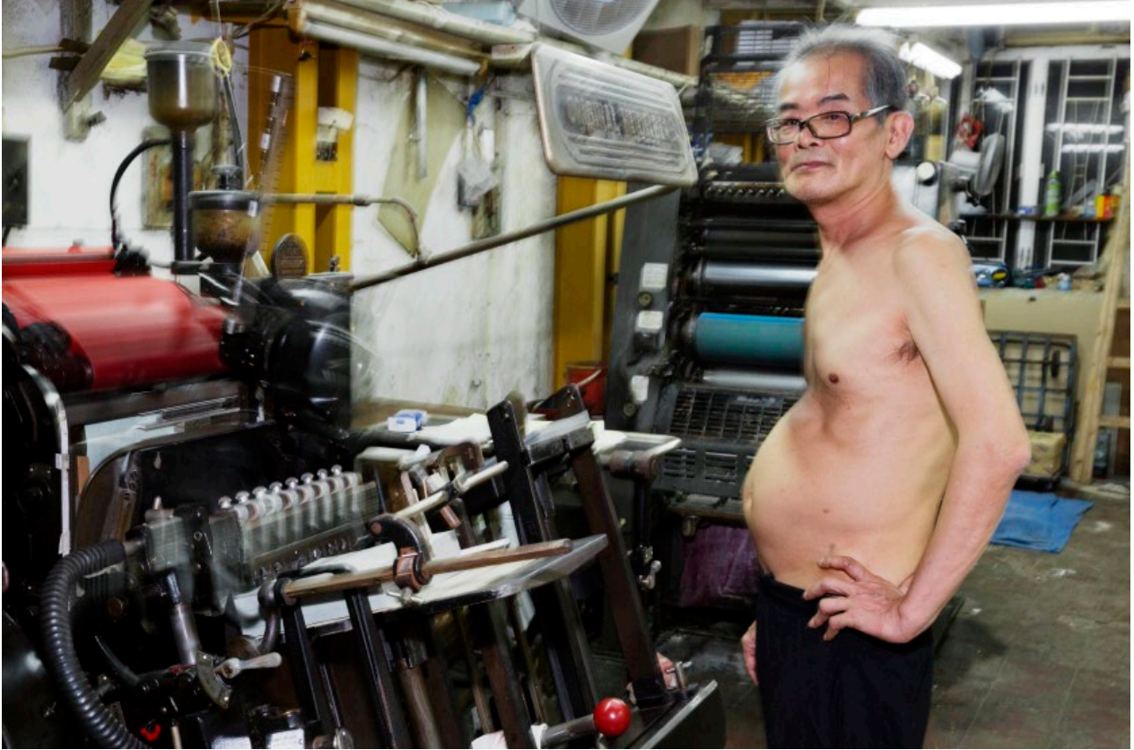
Hong Kong (LON156354) 2013 Pigment print