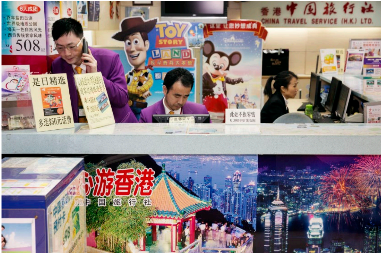
Hong Kong (LON156448) 2013 Pigment print