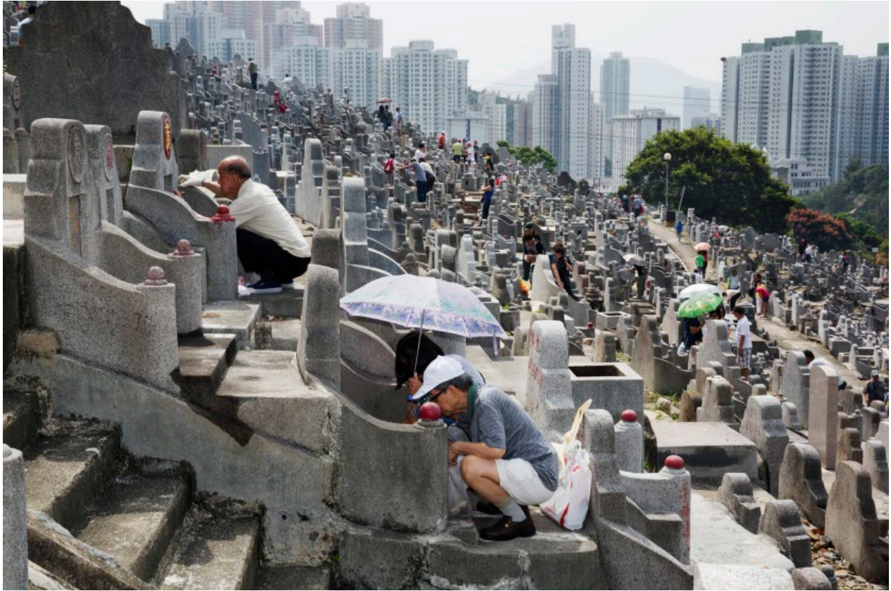
Hong Kong (LON156394) 2013 Pigment print