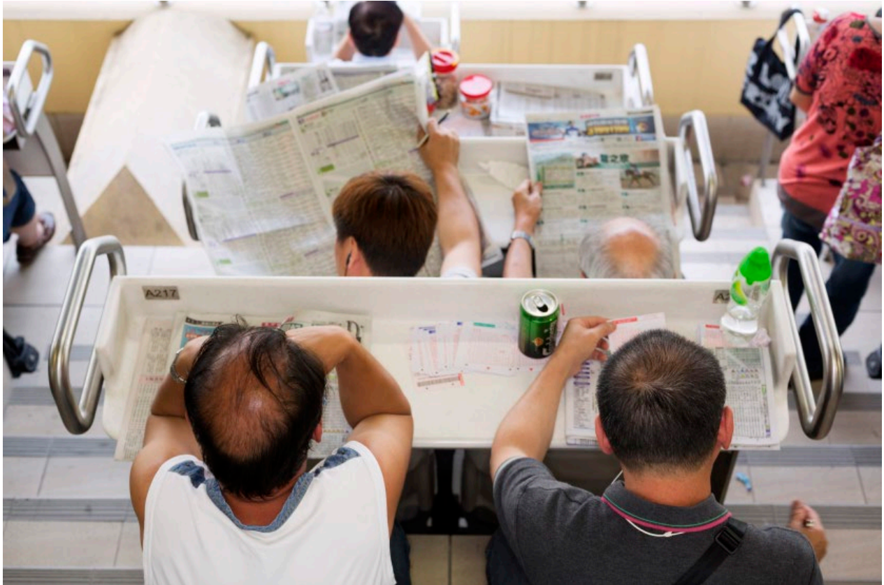
Hong Kong (LON156558) 2013 Pigment print