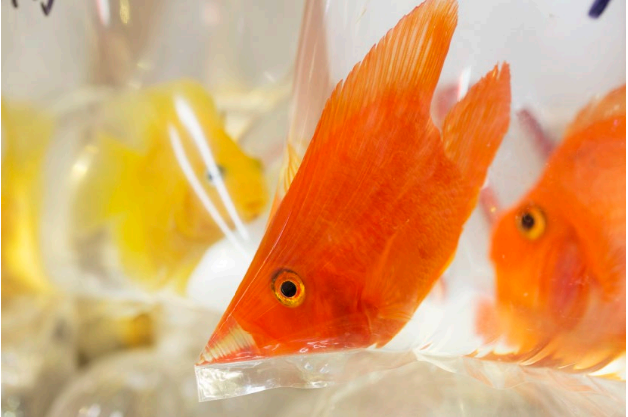
Hong Kong (LON156500) 2013 Pigment print