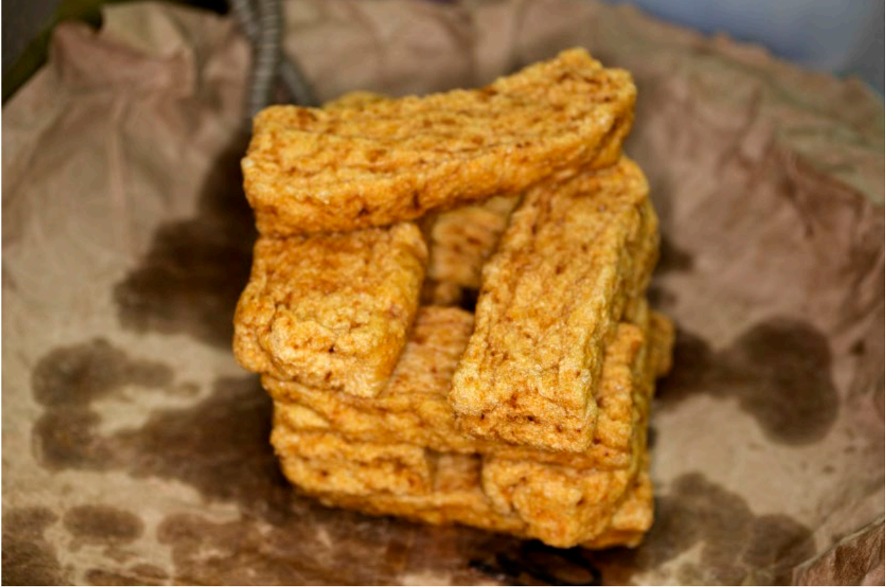
Hong Kong (LON156355) 2013 Pigment print