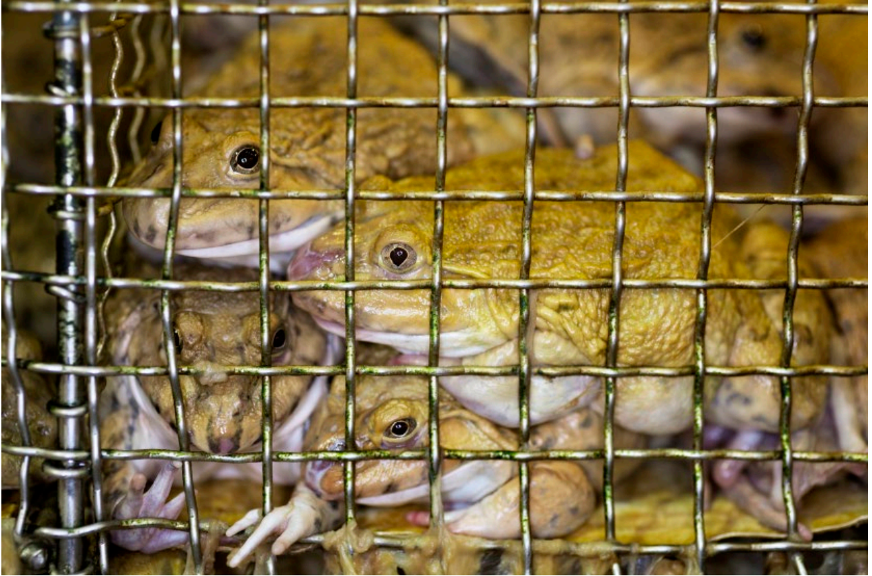
Hong Kong (LON156367) 2013 Pigment print