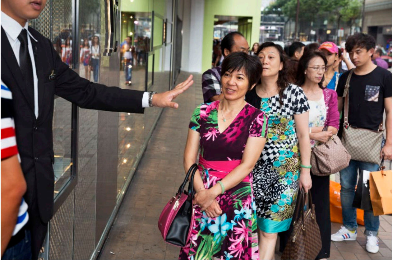
Hong Kong (LON156472) 2013 Pigment print