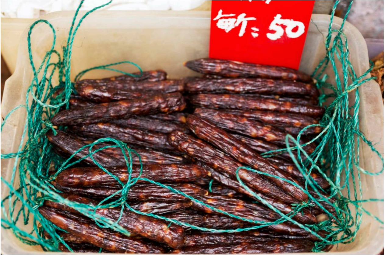
Hong Kong (LON156457) 2013 Pigment print