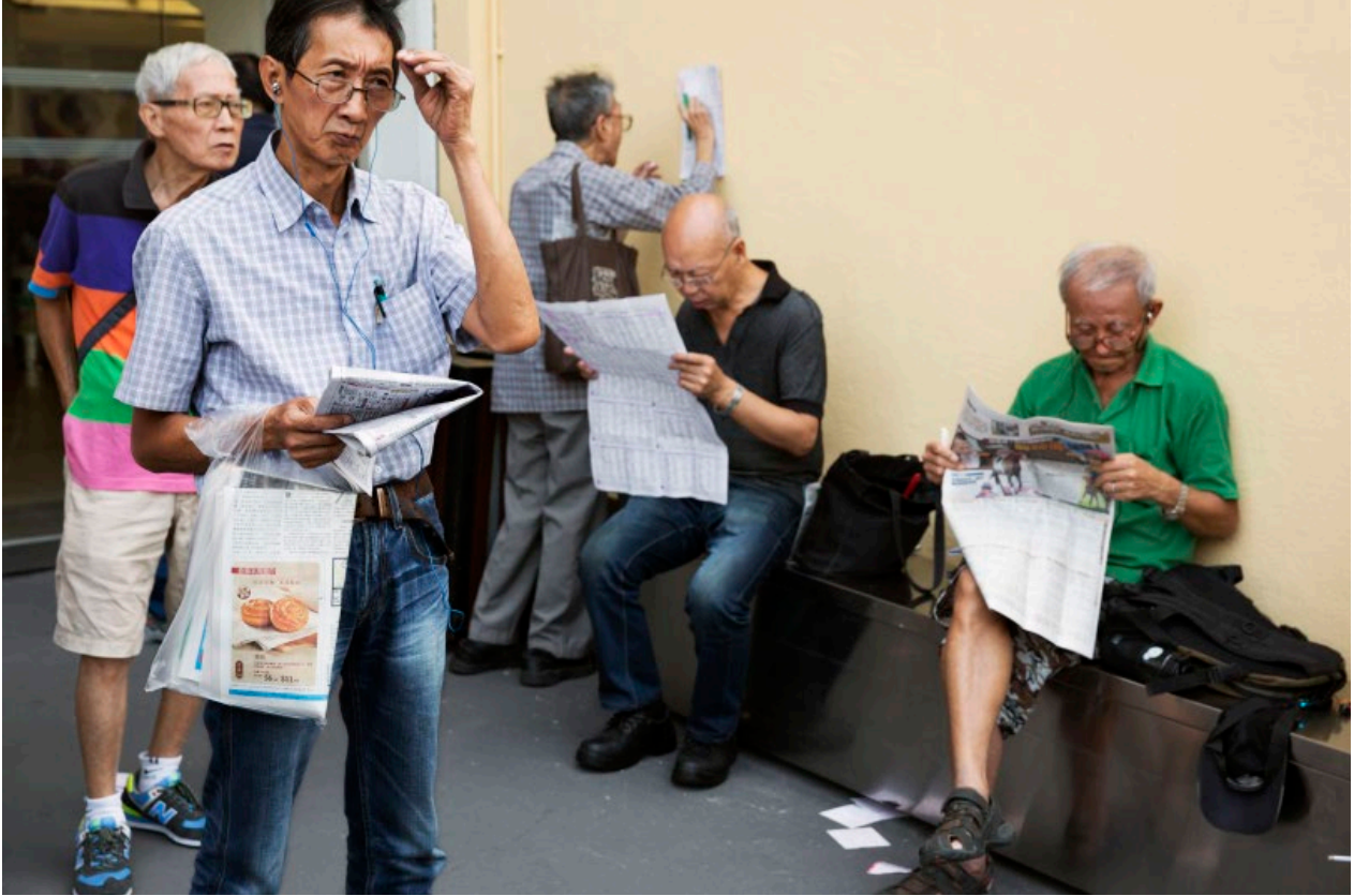
Hong Kong (LON156550) 2013 Pigment print