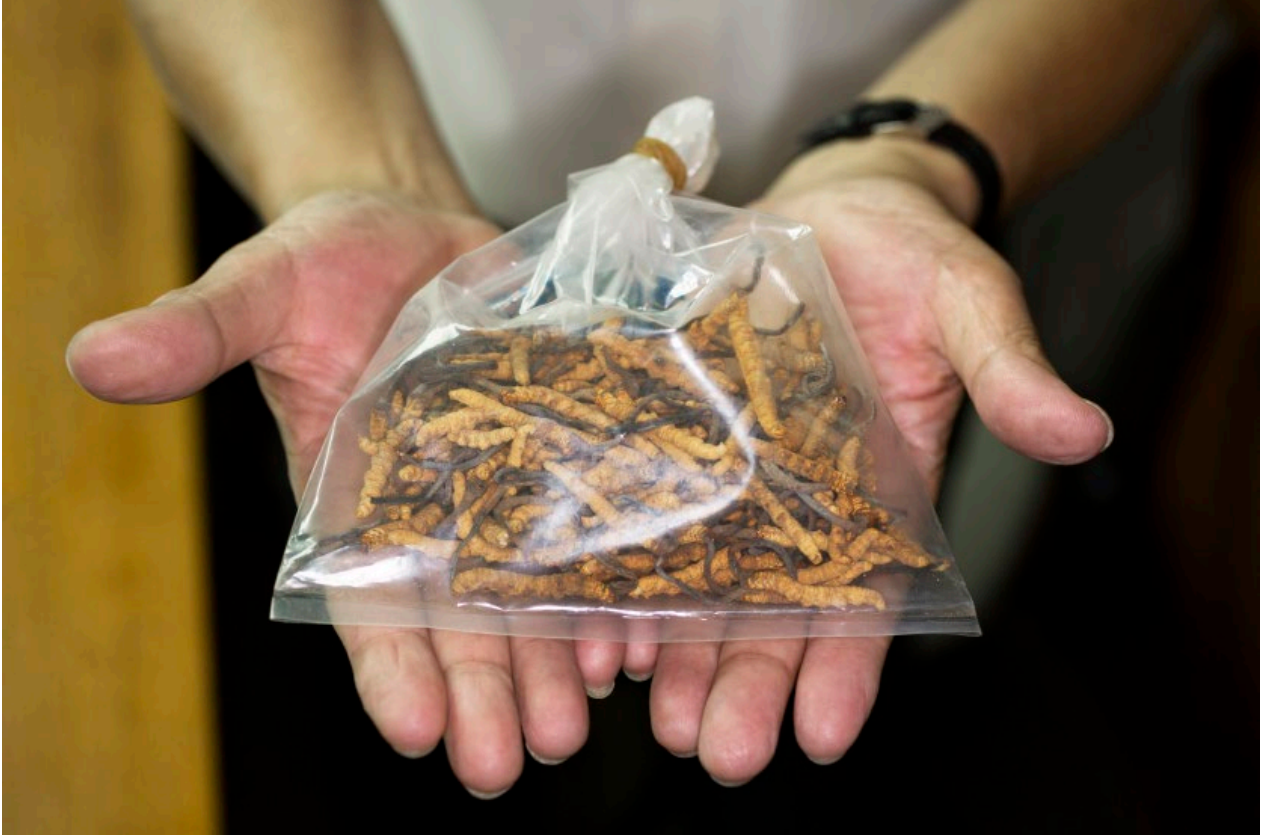
Hong Kong (LON158315) 2013 Pigment print