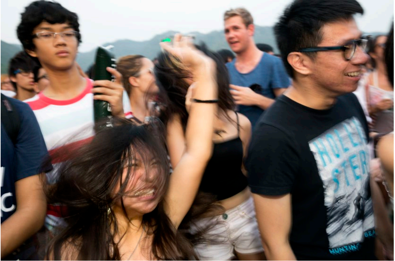
Hong Kong (LON156383) 2013 Pigment print