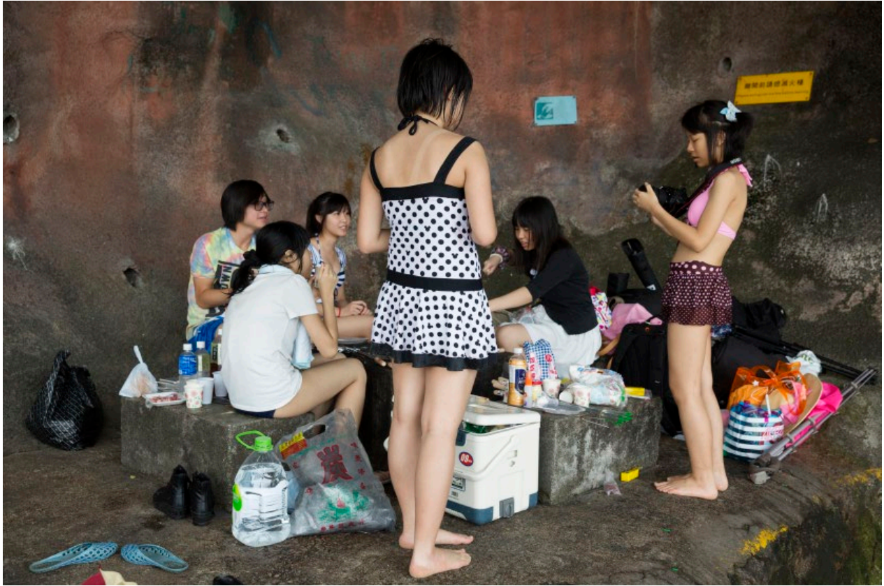
Hong Kong (LON158784) 2013 Pigment print