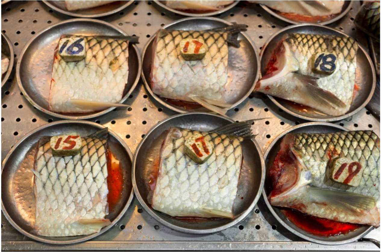
Hong Kong (LON158318) 2013 Pigment print