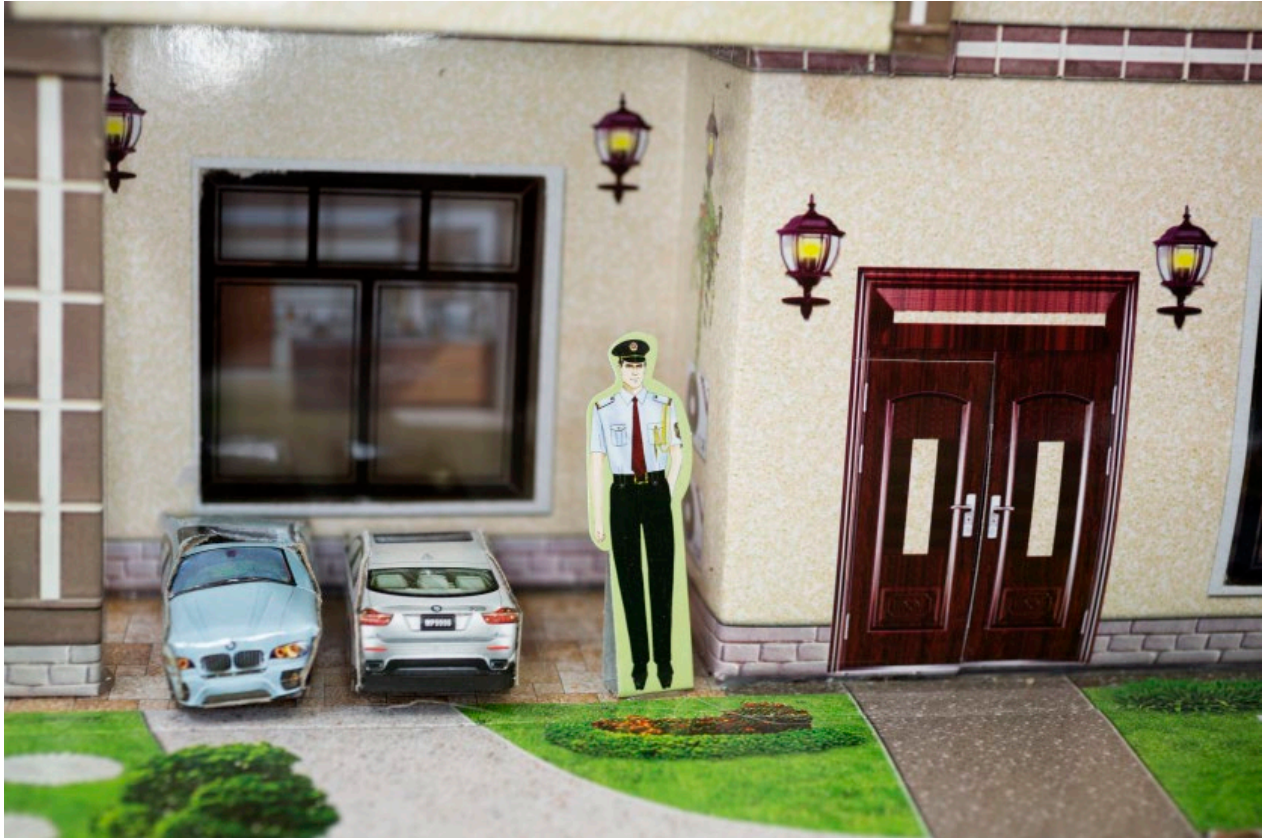
Hong Kong (LON156392) 2013 Pigment print