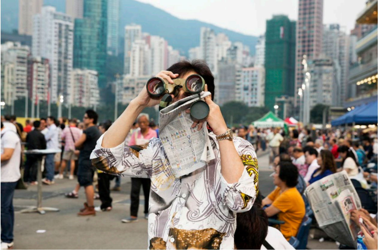
Hong Kong (LON156562) 2013 Pigment print