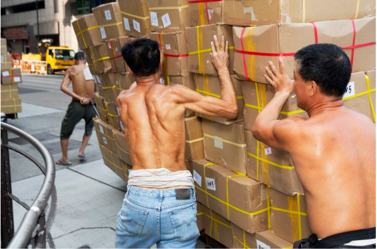
Hong Kong (LON156461) 2013 Pigment print