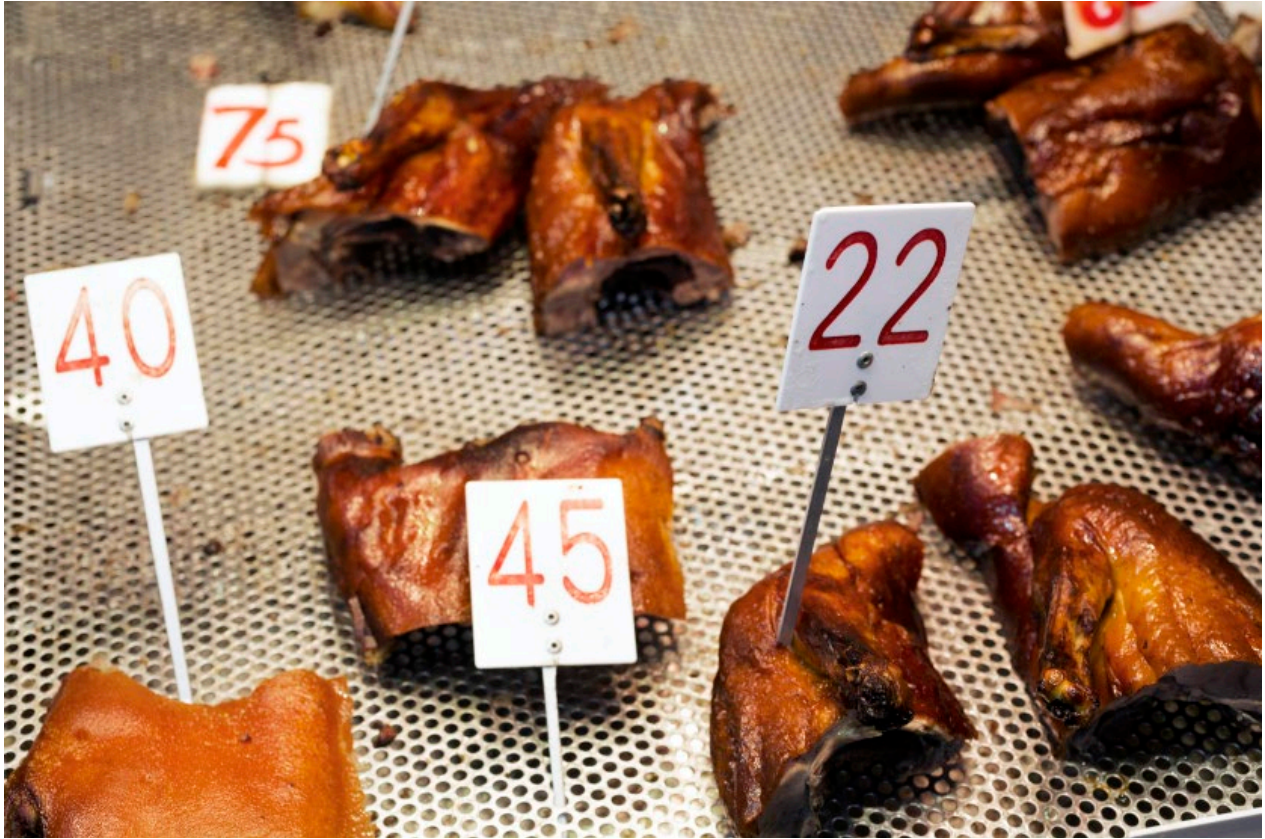
Hong Kong (LON158321) 2013 Pigment print