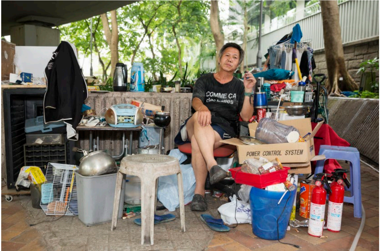
Hong Kong (LON156496) 2013 Pigment print