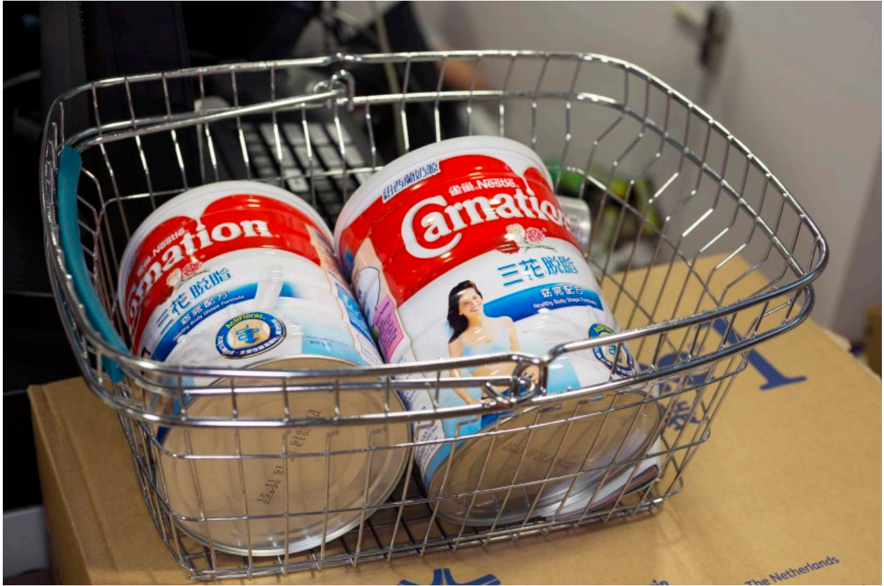
Hong Kong (LON158313) 2013 Pigment print