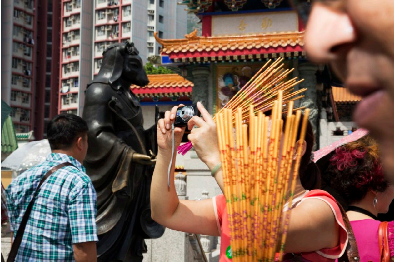
Hong Kong (LON156399) 2013 Pigment print