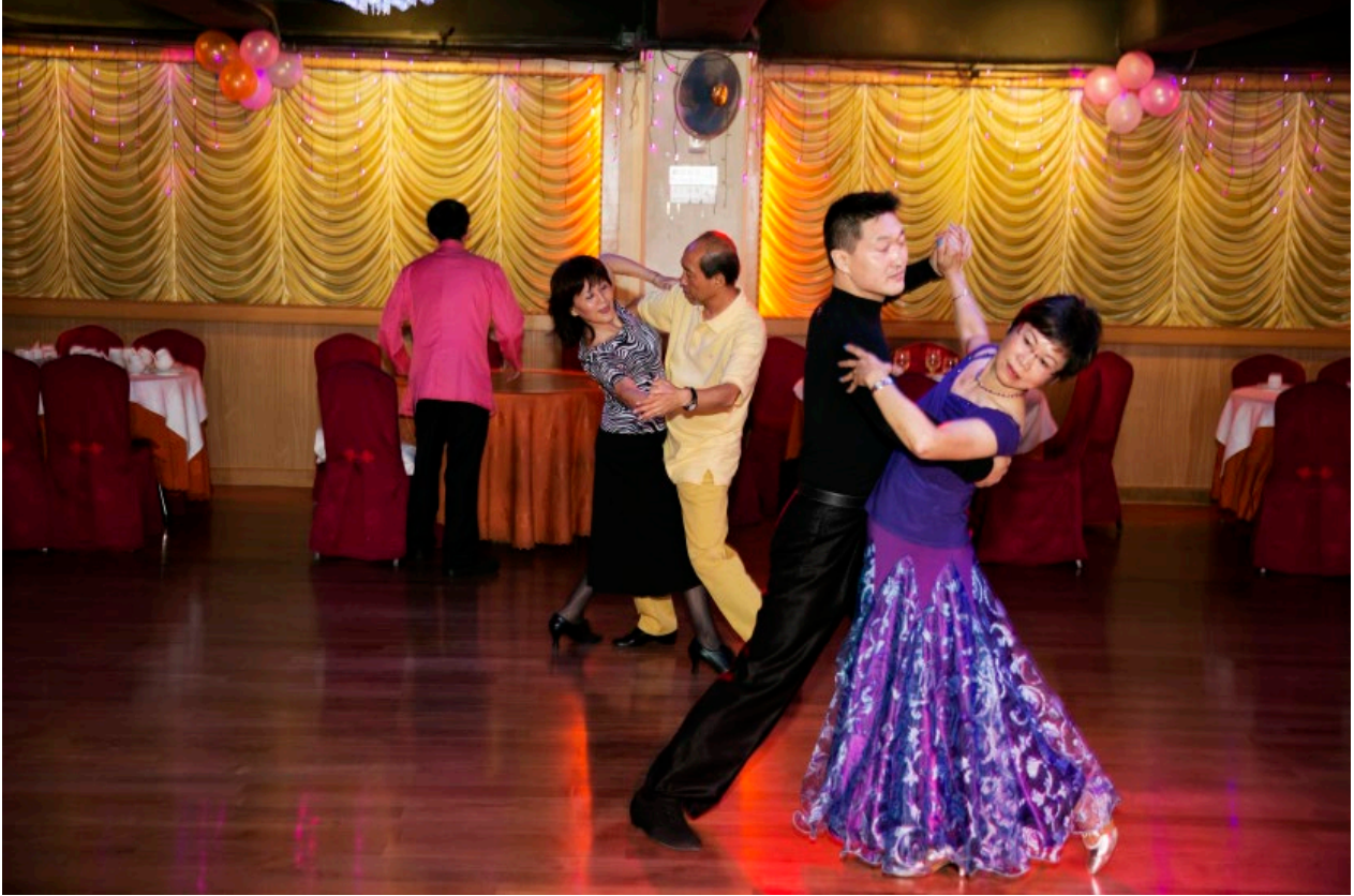
Hong Kong (LON156434) 2013 Pigment print