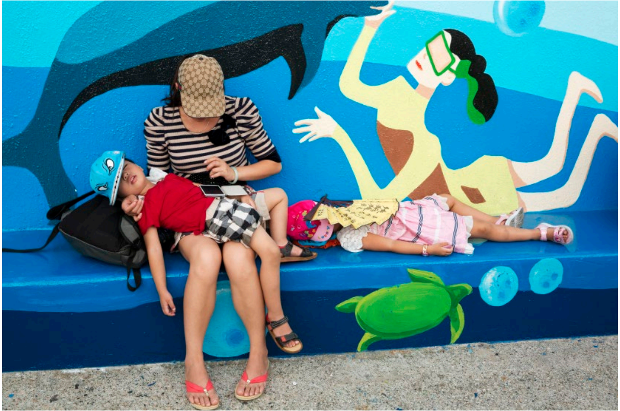
Hong Kong (LON156411) 2013 Pigment print