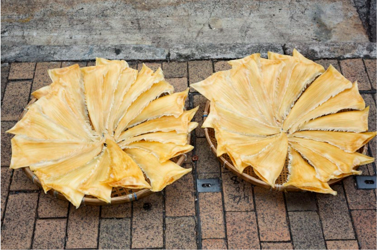
Hong Kong (LON156459) 2013 Pigment print