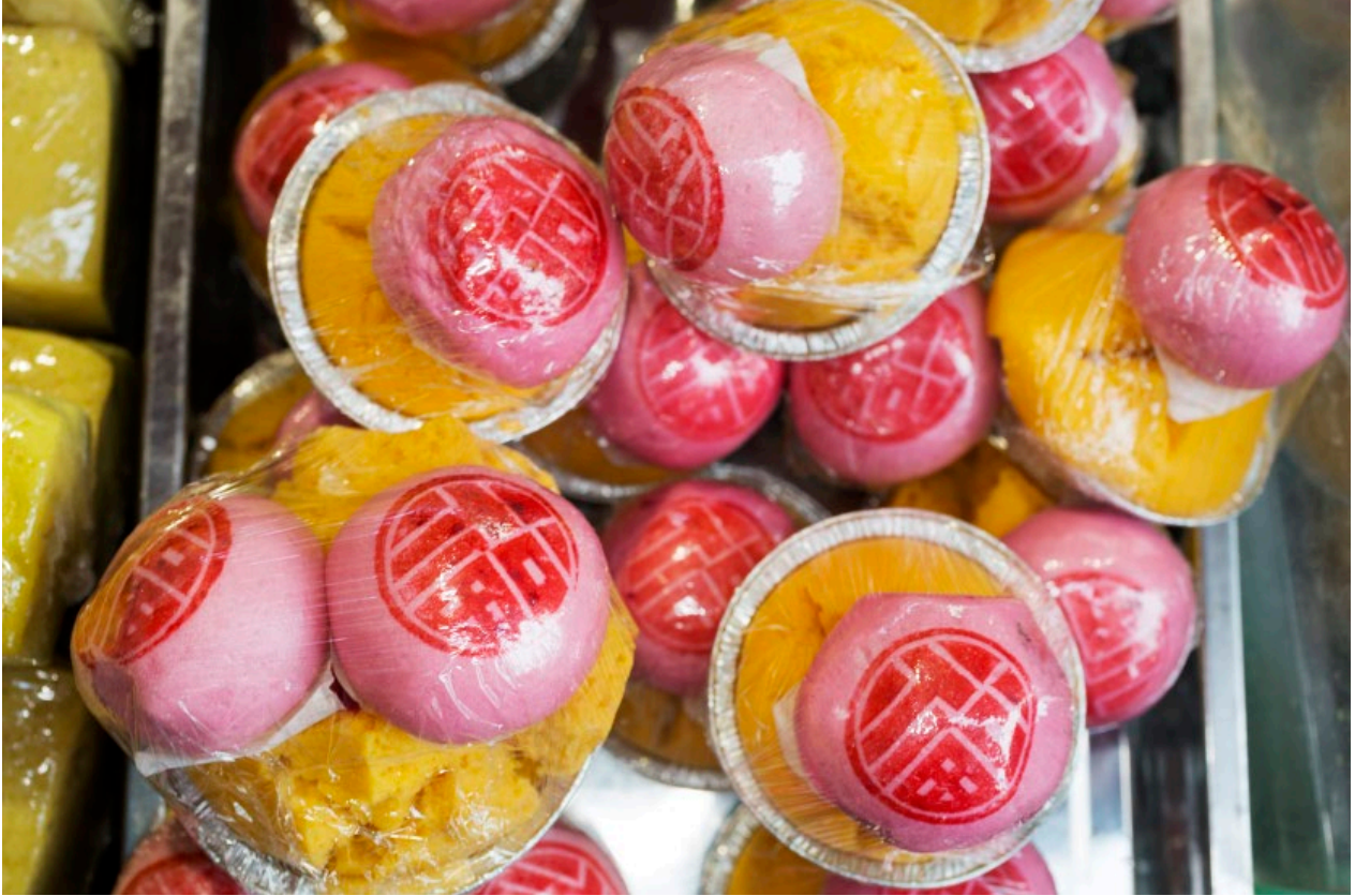
Hong Kong (LON156452) 2013 Pigment print