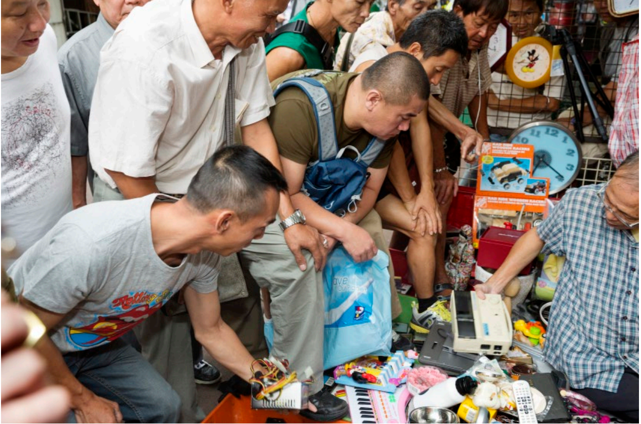
Hong Kong (LON156486) 2013 Pigment print