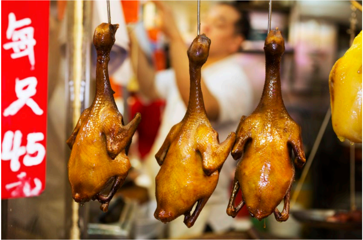
Hong Kong (LON159441) 2013 Pigment print