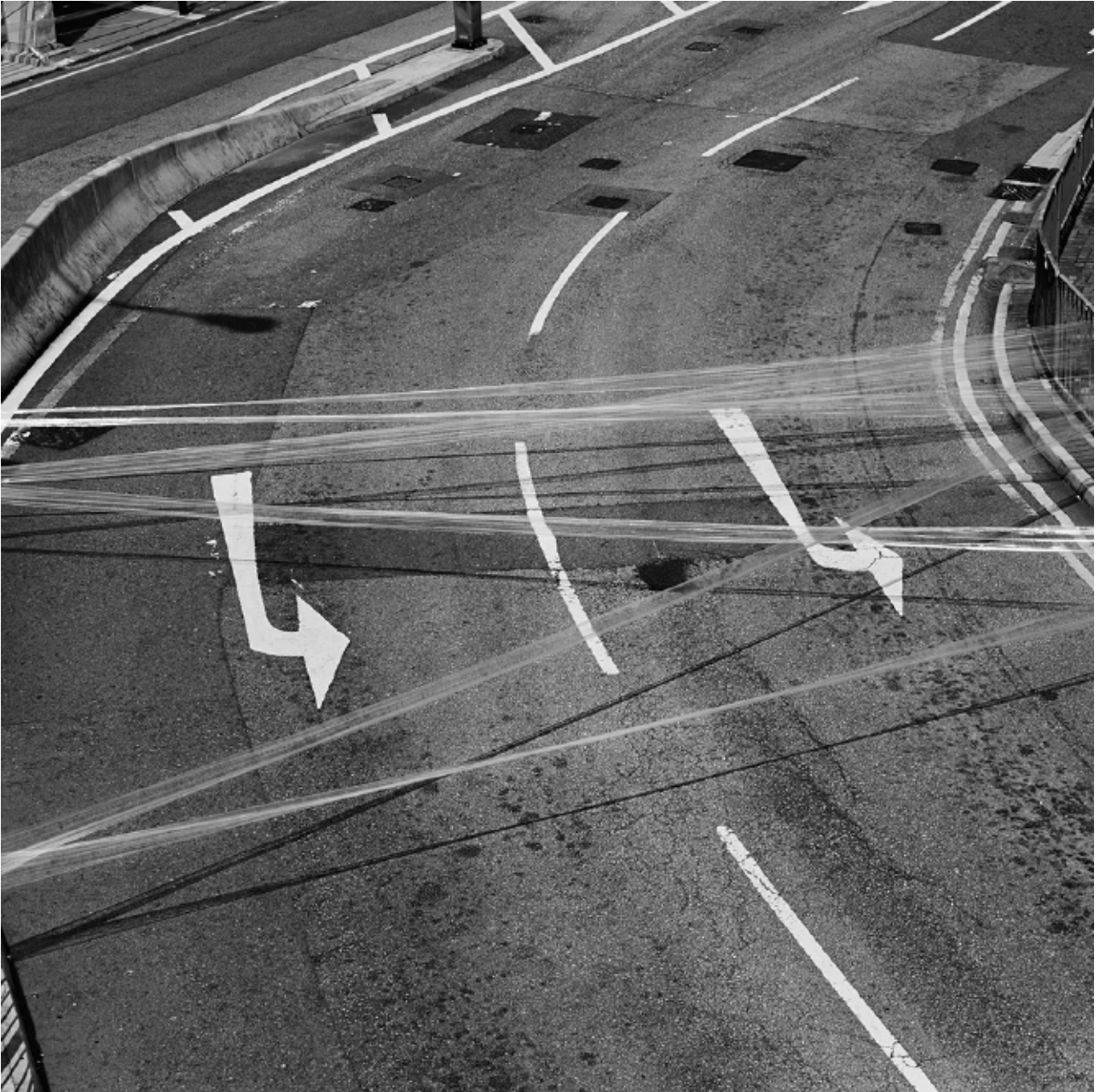
The Umbrella Salad XXV 《散景 貳拾伍》 2014

Archival inkjet print / 收藏級噴墨打印 45.7 x 45.7 cm Edition of 10 / 版本: 10