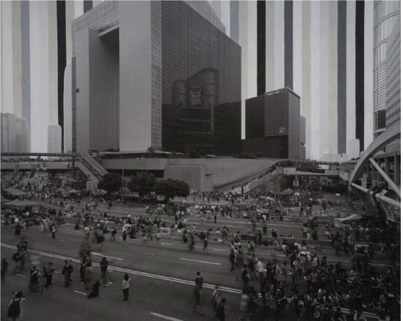
Not Every Daily VII 《不平日常 柒》 2015

Watercolour on archival inkjet print / 水彩、收藏級噴墨打印 73 x 91.5 cm