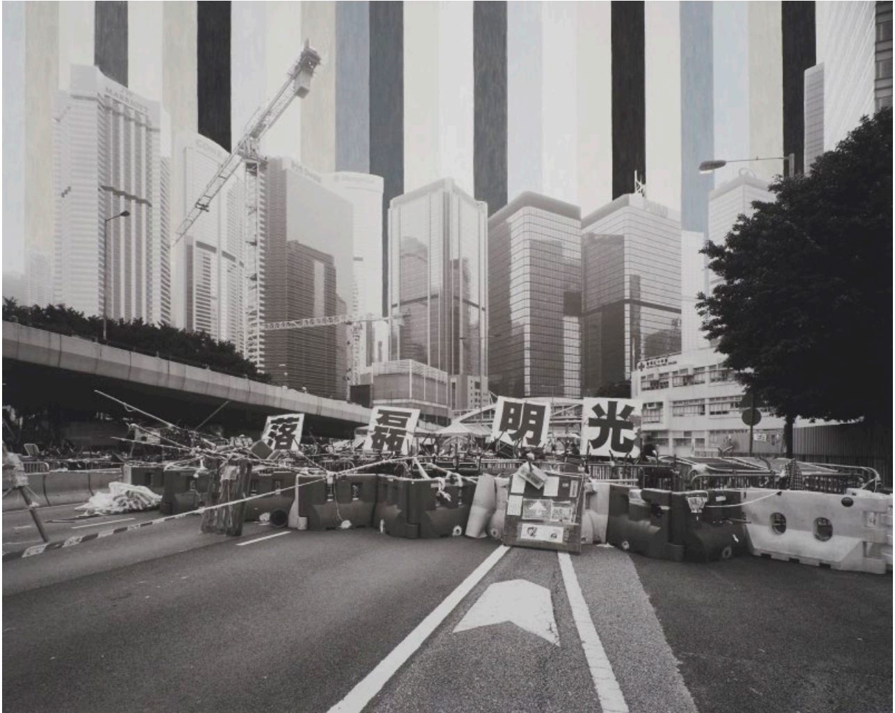
Not Every Daily IV 《不平日常 肆》