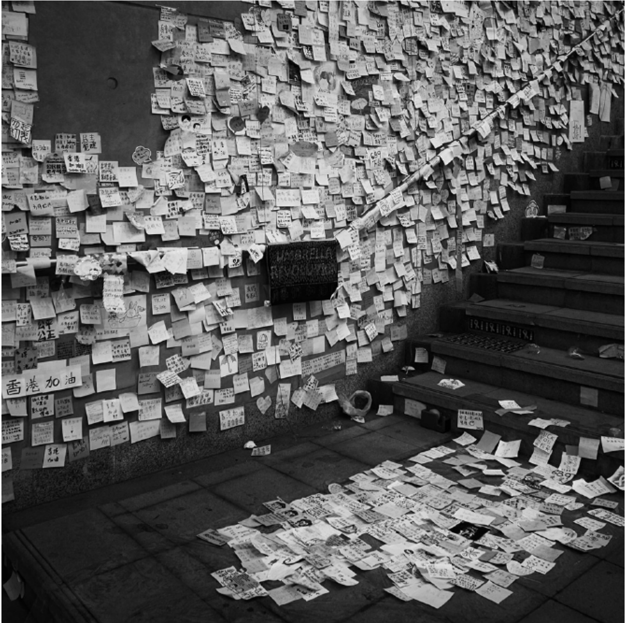
The Umbrella Salad XXVI 《散景 貳拾陸》 2014

Archival inkjet print / 收藏級噴墨打印 45.7 x 45.7 cm Edition of 10 / 版本: 10