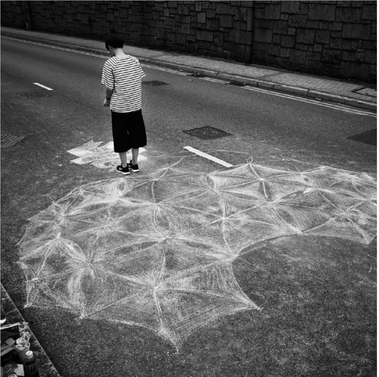
The Umbrella Salad XXVII 《散景 貳拾柒》 2014

Archival inkjet print / 收藏級噴墨打印 45.7 x 45.7 cm Edition of 10 / 版本: 10