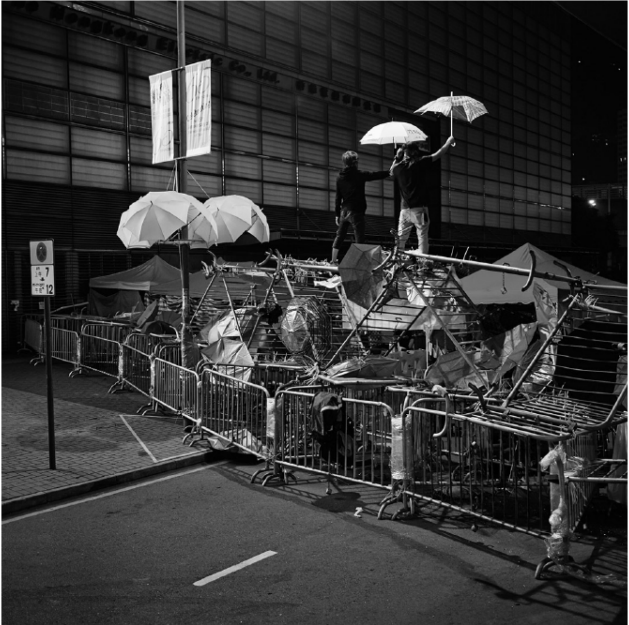
The Umbrella Salad XIV 《散景 拾肆》 2014

Archival inkjet print / 收藏級噴墨打印 45.7 x 45.7 cm Edition of 10 / 版本: 10