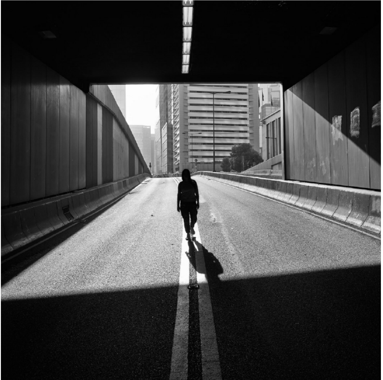
The Umbrella Salad II 《散景 貳》