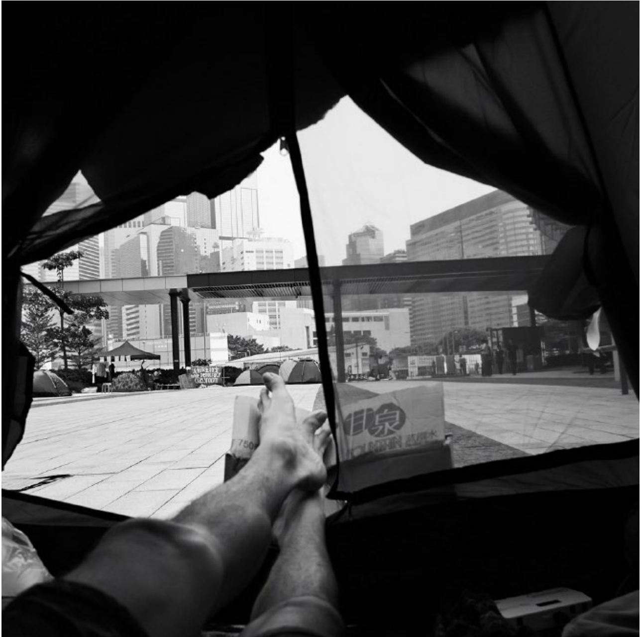
The Umbrella Salad XXII 《散景 貳拾貳》 2014

Archival inkjet print / 收藏級噴墨打印 45.7 x 45.7 cm Edition of 10 / 版本: 10