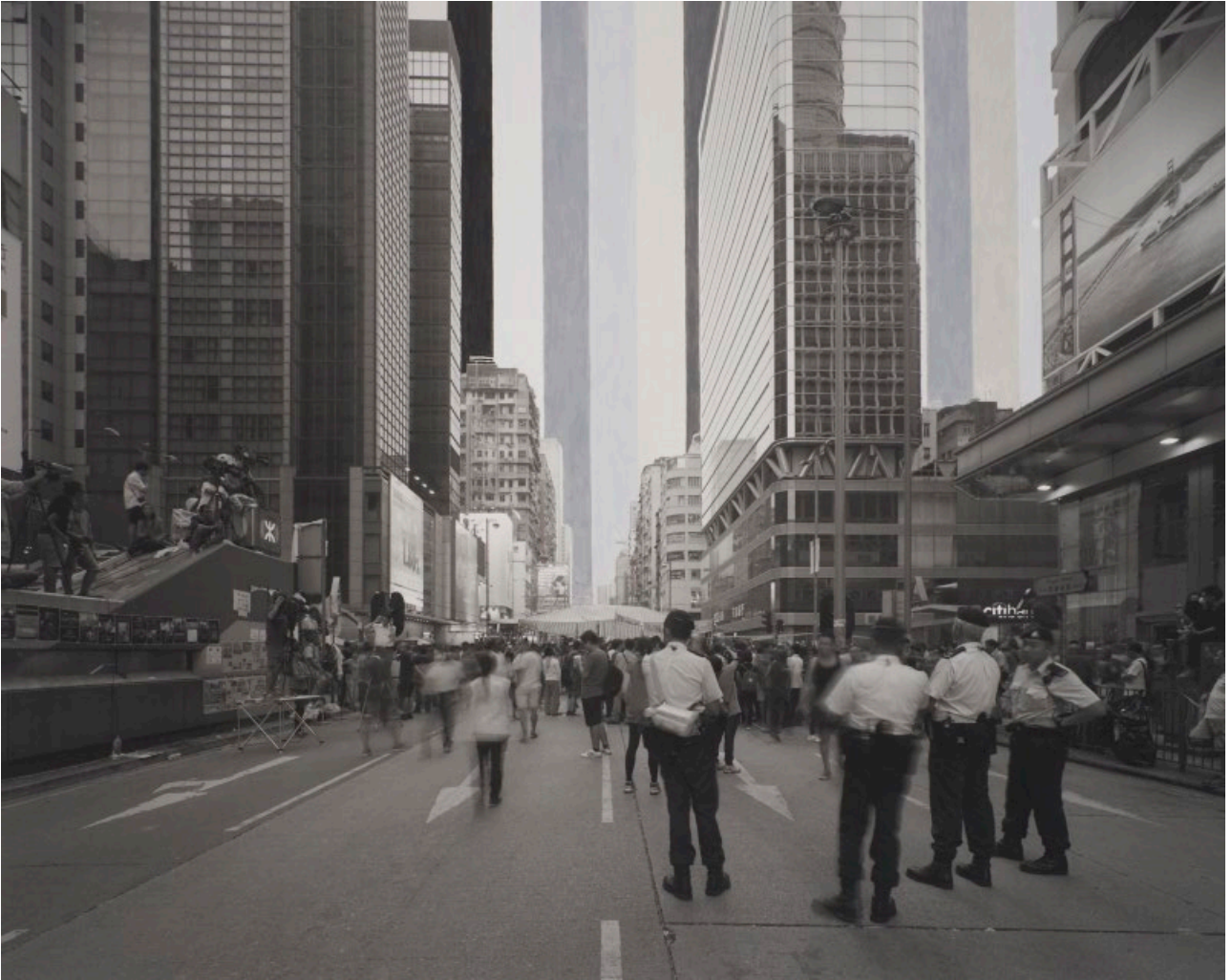
Not Every Daily V 《不平日常 伍》 2015

Watercolour on archival inkjet print / 水彩、收藏級噴墨打印 54 x 61 cm