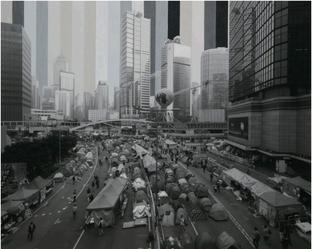
Not Every Daily VI 《不平日常 陸》