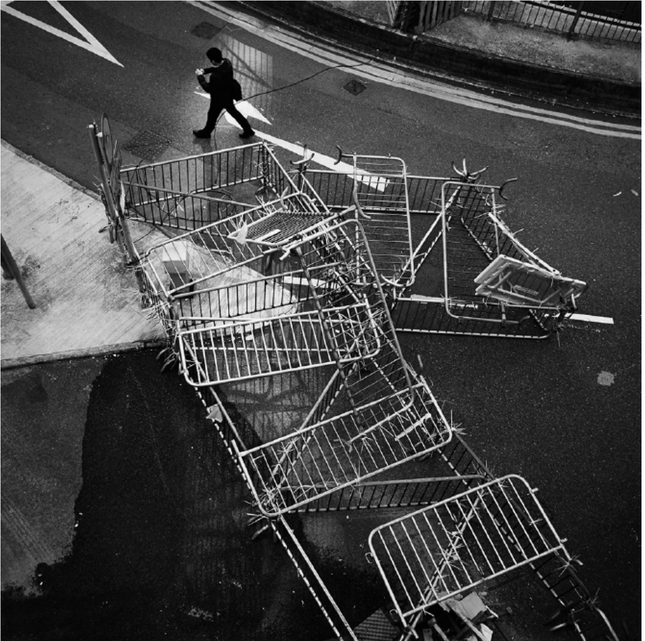
The Umbrella Salad XIII 《散景 拾叁》 2014

Archival inkjet print / 收藏級噴墨打印 45.7 x 45.7 cm Edition of 10 / 版本: 10