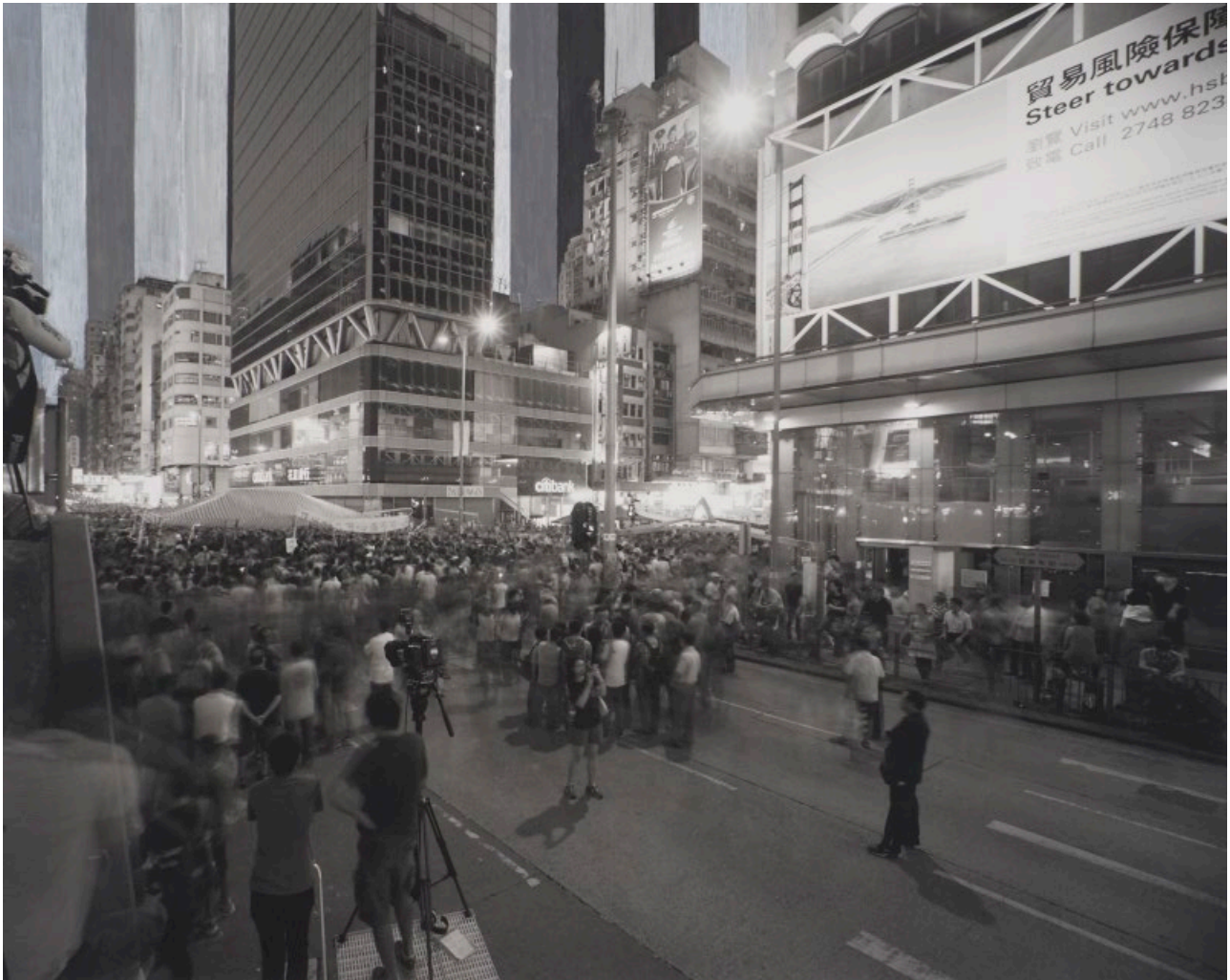
Not Every Daily III 《不平日常 叁》