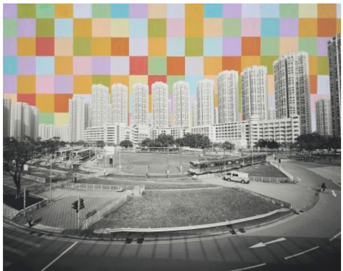
Every Daily (2013)

Since 2013, Ho has been incorporating the element of painting into his photography, in Every Daily (2013) Ho filled the sky between the densely packed buildings with uniformly sized blocks of different colours on the photographs. In Not Every Daily , Ho replaced the colourful blocks with stripes of different shades of grey. To the artist, these stripes of uniform width resemble signs of authority, restriction and control.