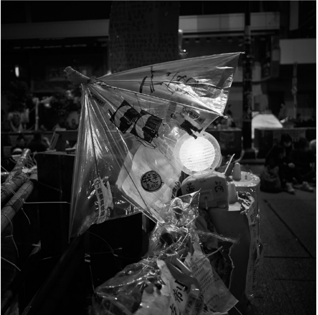
The Umbrella Salad X 《散景 拾》