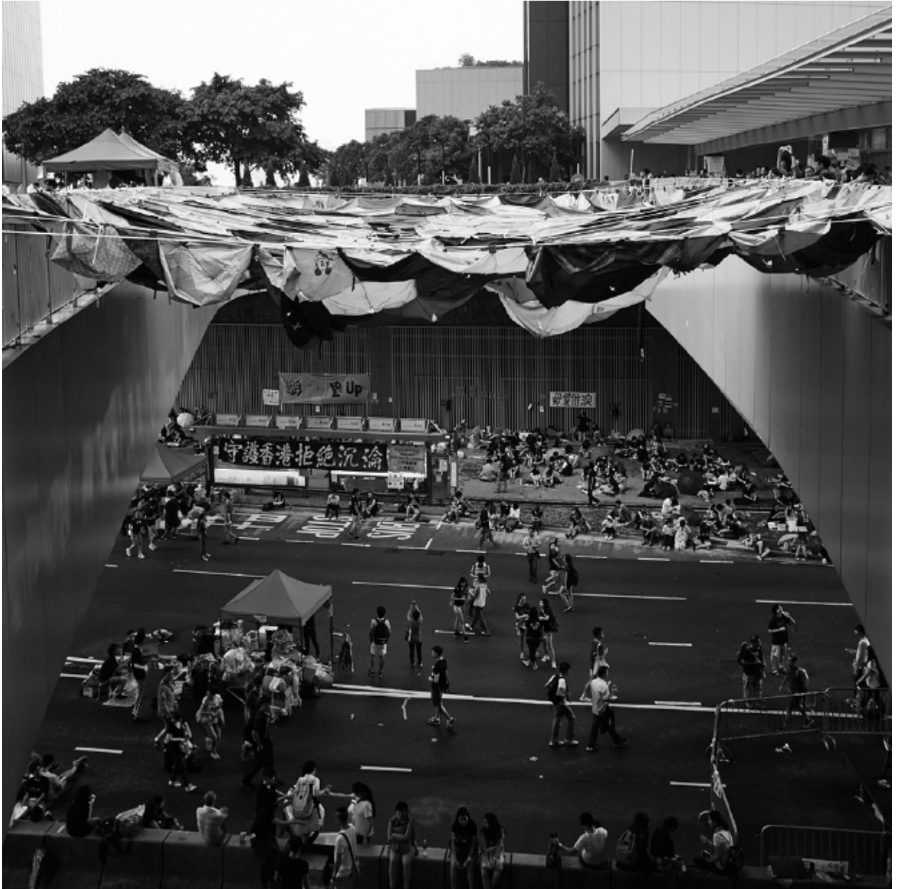
The Umbrella Salad XVII 《散景 拾柒》