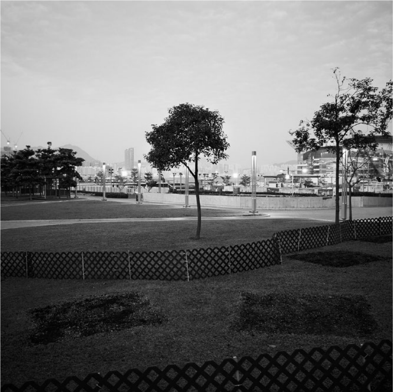
The Umbrella Salad XXX 《散景 叁拾》 2014

Archival inkjet print / 收藏級噴墨打印 45.7 x 45.7 cm Edition of 10 / 版本: 10